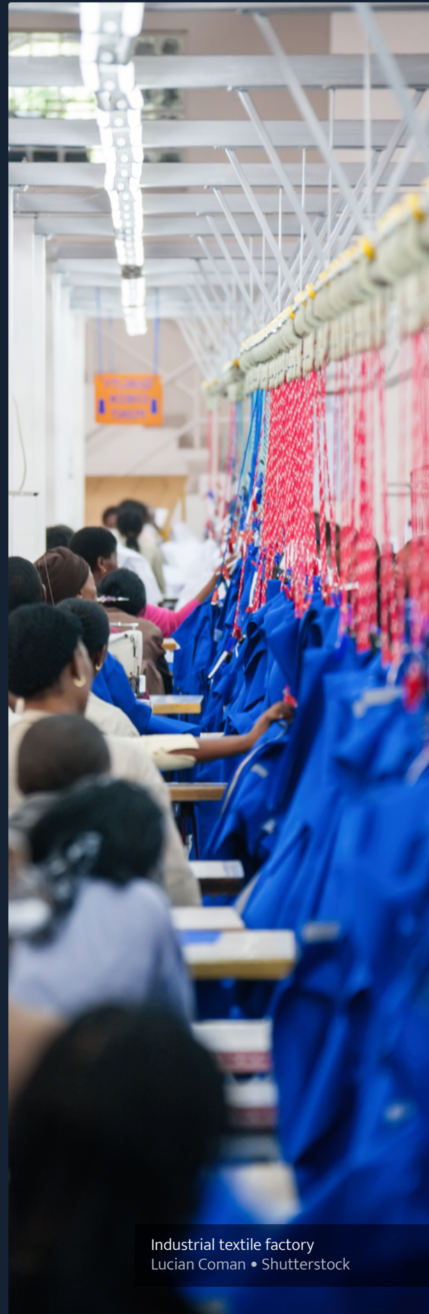
Industrial textile factory

Disclaimer: The good practice examples provided in this Toolkit are for illustrative purposes only and not as an endorsement of any given practice or company.