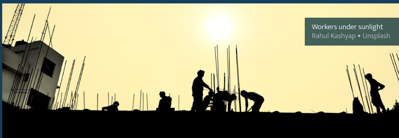
Workers under sunlight

Lendlease is a large global company in the construction sector. This industry is considered high risk due to the complex and fragmented supply chains which encompass both product and services. According to its 2022 MS statement, Lendlease has 12,200 active suppliers. 35 They provide a detailed account of how they implement due diligence in their supply chains and assess risks for sourcing services such as cleaning, general maintenance, and security as well as sourcing items such as concrete, steel, hydraulics and plastering. This includes how they have implemented a supply chain audit program and a case study of its effectiveness with one large contractor The Exchange TRX from Malaysia. 36 Lendlease engaged Bureau Veritas and performance was assessed against the Ethical Trade Initiative Base code so that it conformed to local laws and a structured methodology for reviewing documents, site visits and interviews of employees and management was followed. The key outcomes included improving processes for onboarding migrant site workers, providing documentation in native language and providing relevant training to migrant workers around modern slavery risks.