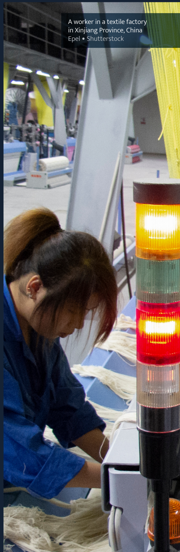
A worker in a textile factory in Xinjiang Province, China