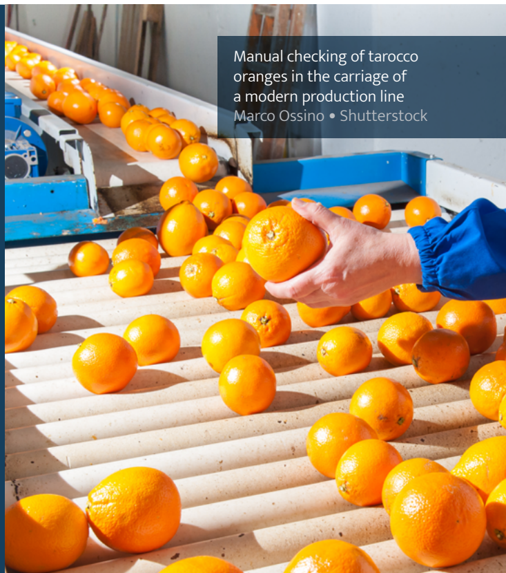
Manual checking of tarocco oranges in the carriage of a modern production line

In their 2022 modern slavery statement, Australian retail group Woolworths revealed the identification of forced labour in one of their Malaysian suppliers. 44 Investigations indicated the presence of 'debt bondage, excessive overtime, retention of identity documents, restriction of movement, and withholding wages including penalties for leaving employment or bonds for workers to return to their home country'. 45 Woolworths reported working with its supplier and a local NGO to ensure repayment of recruitment fees to migrant workers and instigate changes for improved working conditions. The company has prioritised supplier engagement and capacity building for a two-year period to monitor changes in procedures and practices.