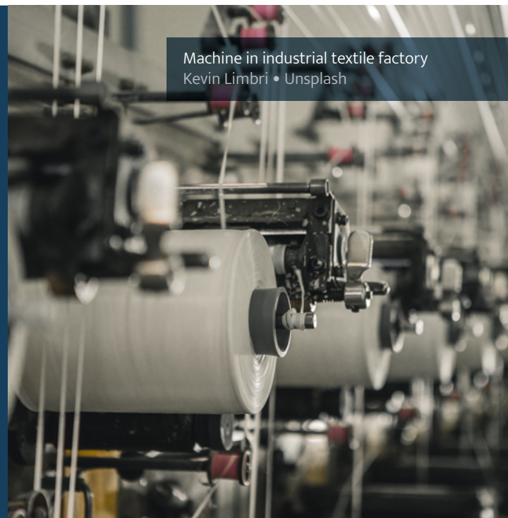
Machine in industrial textile factory

Kathmandu's grievance mechanism is anonymous and accessible to workers in their own language and on their own phone through social media platforms such as WeChat in China and Zalo in Vietnam that enable them to connect directly with Kathmandu CSR. 26 This increases the accessibility of remediation to these workers. It is committed to providing full compensation to workers for harms they have caused or contributed to.