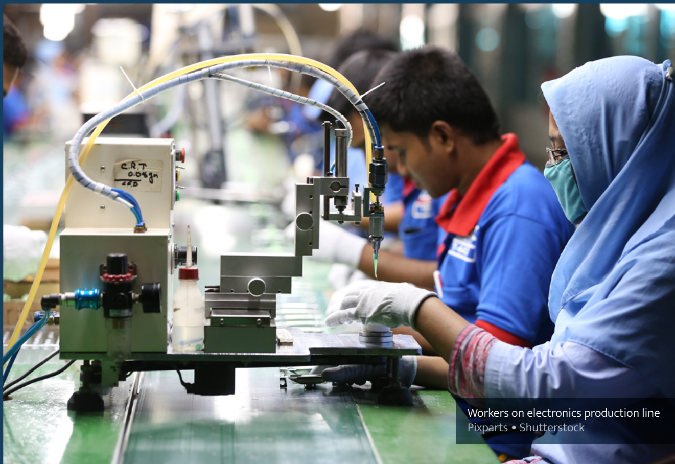
Workers on electronics production line

NXP recognised the need to improve grievance mechanisms, so in addition to the hotline, they developed a tool for operational-level grievances. Site visits confirmed that workers use smart phones. They developed an app called 'WOVO' and piloted it at the Kuala Lumpur manufacturing site for greater access to grievance processes, particularly for migrant workers who are highly vulnerable to modern slavery. 95% of workers at the pilot site have downloaded the app. NXP note that a high level of commitment is required to ensure that the app is implemented effectively to ensure timely and appropriate responses and maintain trust. Assessing whether vulnerable workers are engaging with existing tools and understanding how vulnerable workers best engage (e.g. considering language needs, anonymity, access to smartphones) is key to an effective grievance mechanism.