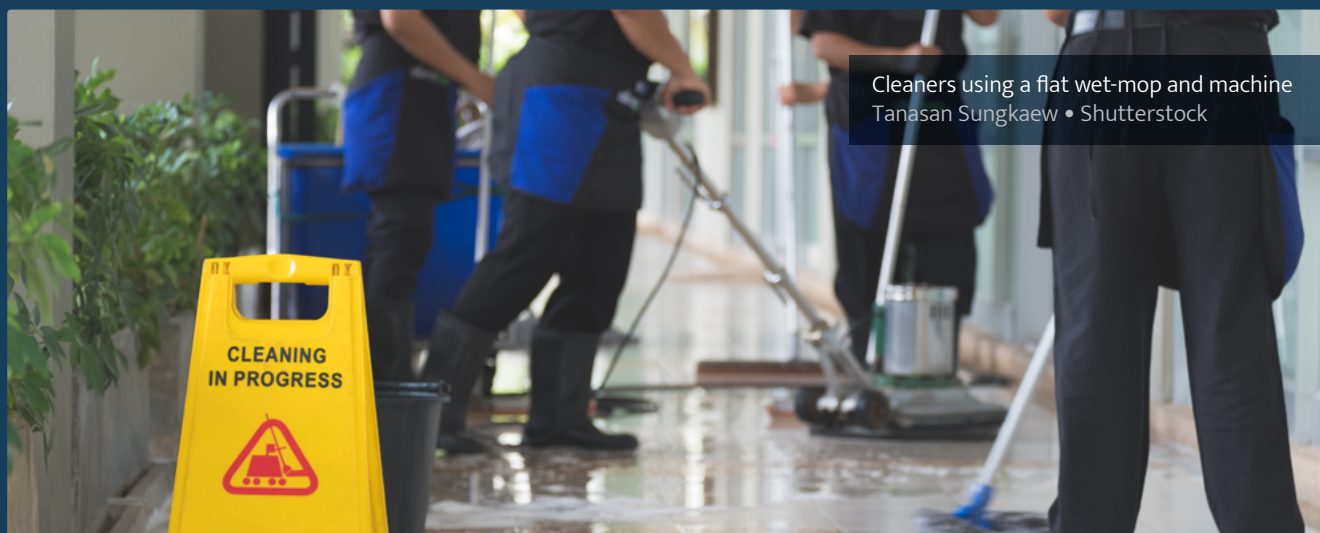
Cleaners using a flat wet-mop and machine

A key component of CAF's process is conducting independent audits. These audits involve engaging with cleaners at worker engagement meetings and collecting information on their working conditions and pay via a survey. This direct engagement with workers helps to uncover labour violations and ensures that workers have a voice. CAF works closely with the trade union to ensure that workers' interests are represented in decision-making processes. This allows the trade union to advocate for their members in the context of CAF's certification and remediation efforts. CAF has identified and addressed numerous cases of labour standards non-compliance. 53 Cleaners have played a vital role in this process. Despite the successes in engaging workers and improving labour conditions, CAF faces challenges in achieving industry-wide impact due to its voluntary nature, and there remains substantial resistance among actors in the cleaning supply chain to meaningfully address non-compliance and labour exploitation.