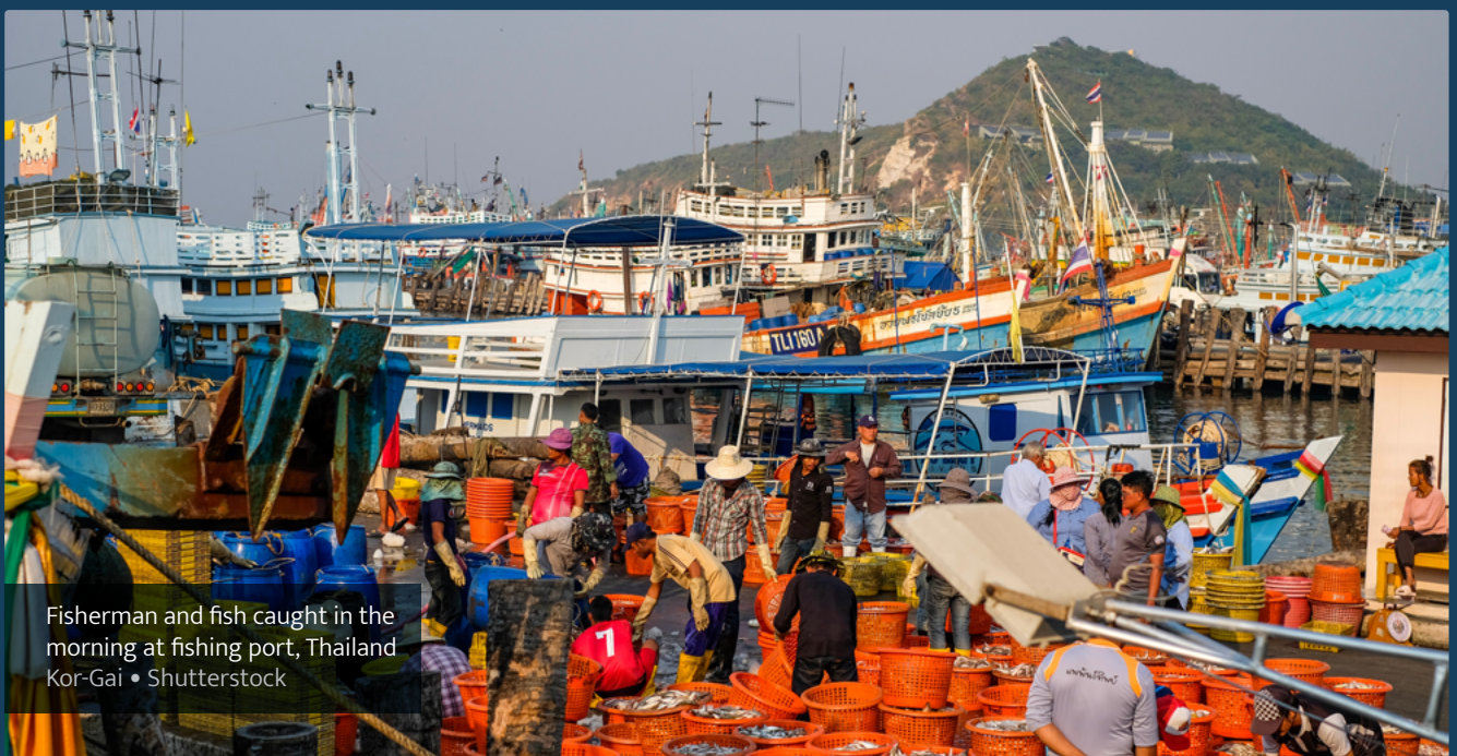
Fisherman and fish caught in the morning at fishing port, Thailand

To address this, Thai Union collaborated with Migrant Workers Rights Network (MWRN – a membership-based organisation for migrant workers from Myanmar residing and working in Thailand) and initiated an ‘Ethical Migrant Recruitment policy’ in 2016. 12 According to independent research conducted by Impactt, the average cost for the workers prior to implementation of the policy was USD 413 - USD 523. 13 MWRN has also collaborated to strengthen the company’s welfare committee system which trains and consults workers about their rights at work. Organisations like MWRN are particularly useful in cross-border work arrangements, even where freedom of association is supported by government.