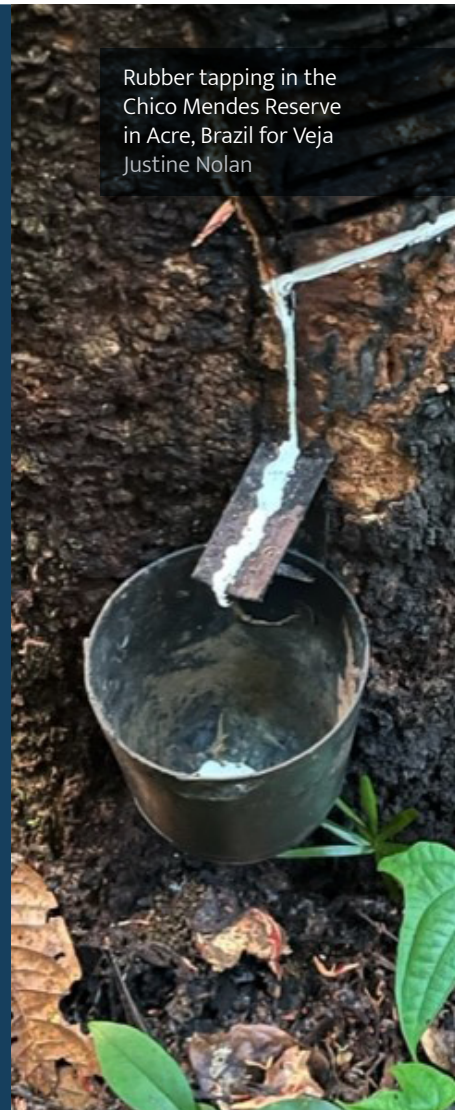
Rubber tapping in the Chico Mendes Reserve in Acre, Brazil for Veja Justine Nolan

Consultation in the design of policies and business processes can result in substantially new business models. Veja shortened its supply chains in order to maintain transparency and control over quality, working conditions and sustainability standards.