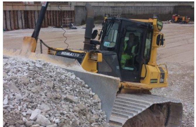
Trainee Dozer Operator