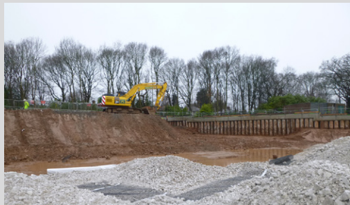
March 2016 commenced exposing the piles following the completion and curing of the capping beam