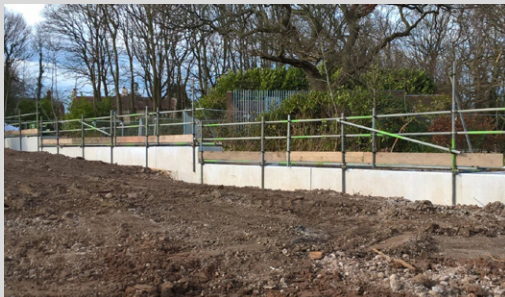
February 2016 constructed beam the capping