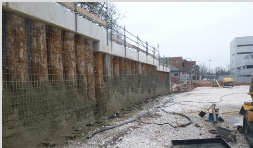
March 2016 sprayed concrete works to the face of the piled wall

We can confirm that the first stage of construction on the enabling works is now complete. This timeline shows the works that have taken place to prepare for the main construction of the building to start in May.