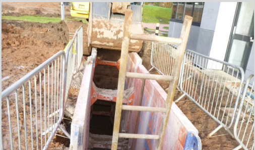
December 2015 - February 2016 carried out drainage diversions