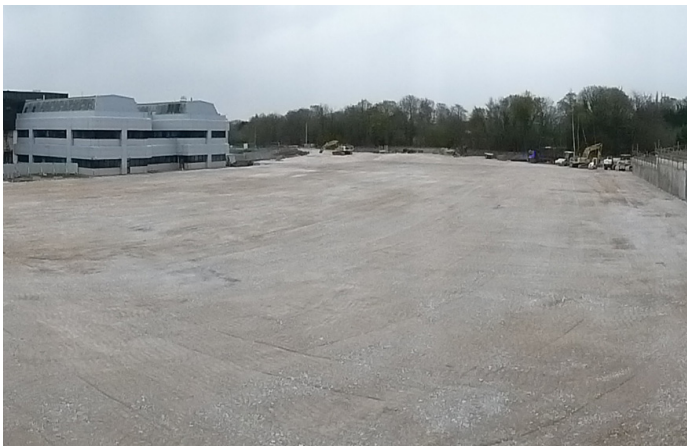
Completed enabling works

We can confirm that the first stage of construction on the enabling works is now complete. This timeline shows the works that have taken place to prepare for the main construction of the building to start in May.