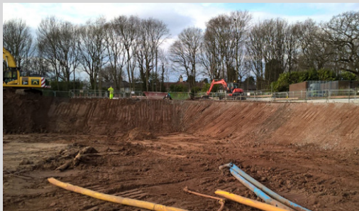
November 2015 - April 2016 removal of 34,000m 3 of soil from site