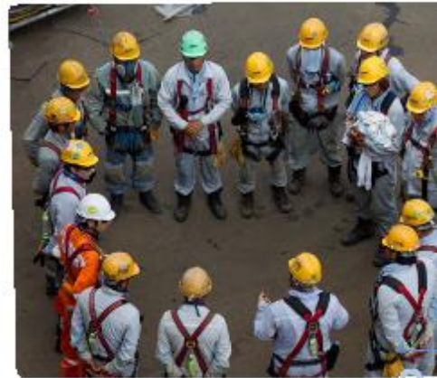
3 Our salient issues

A notable challenge is how to get representatives of government security forces to enter into agreements on security and respect for Human Rights. This continues to be addressed through the use of ongoing dialogue with security forces and other stakeholders (See page 33 for further information).