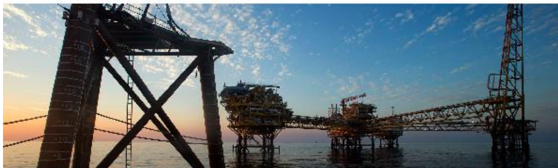
20 Responsible Investment in Fragile Contexts