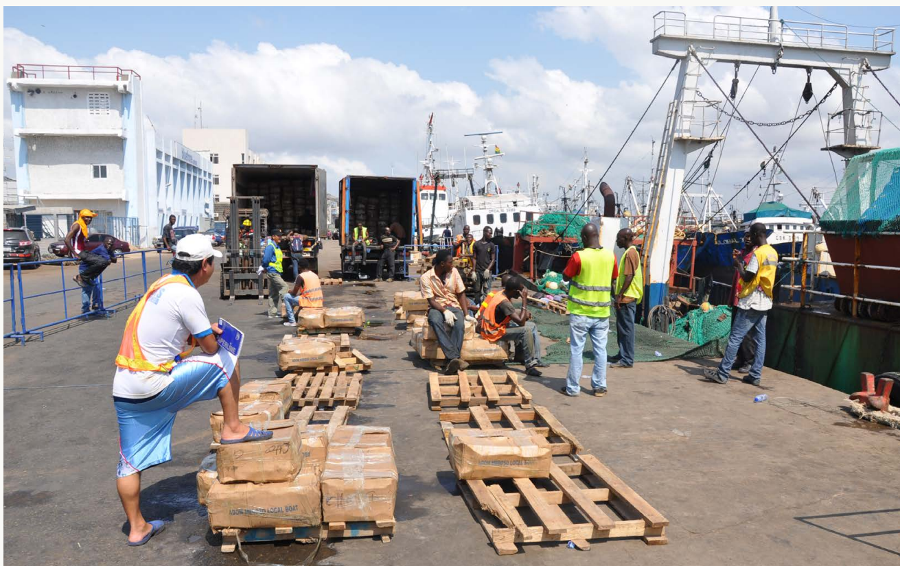
Trawl vessels unloading at Tema port, Ghana.

The findings of this study suggest that Ghana may be failing to guarantee the basic human rights of workers set out in the International Covenant on Economic, Social and Cultural Rights, 1966 (ICESCR). The treatment of workers on some vessels may also reach the threshold of degrading treatment within the meaning of the International Covenant on Civil and Political Rights, 1966 (ICCPR) and African Charter on Human and People's Rights (ACHPR) and forced labour within the meaning of ILO Forced Labour Convention, 1930 (No. 29) and ILO Abolition of Forced Labour Convention, 1957 (No. 105).