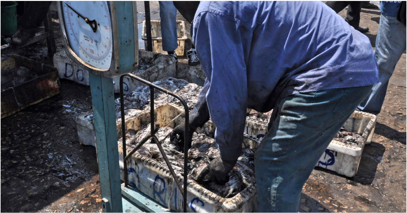
Trawler catches being weighed at Tema port. High value products, such as octopus, cuttlefish and squid, are exported to markets in Europe and elsewhere.