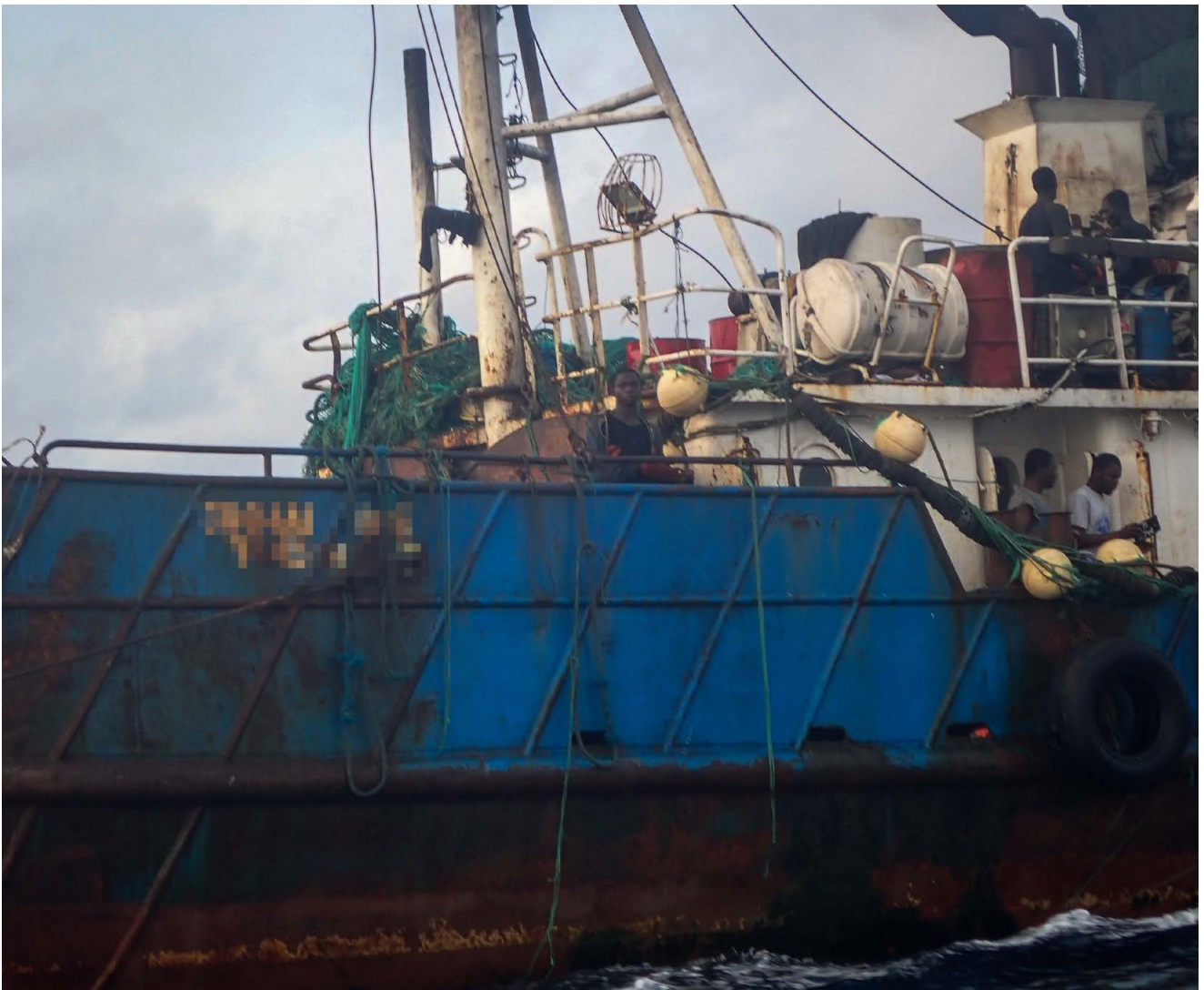
Ghanaian crew on board an industrial trawler.

All 10 crew members interviewed had personally experienced or witnessed physical abuse at the hands of Chinese captains and officers. This was also confirmed by observers we spoke to.