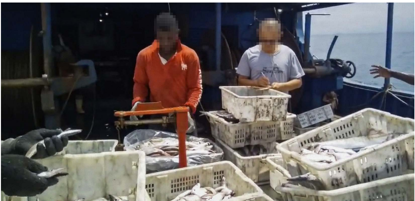
Catches being sorted and recorded on an industrial trawl vessel in Ghana.

Reference is also made to the non-binding provisions of the ILO Work in Fishing Recommendation, 2007 (No. 199) and the 1995 FAO Code of Conduct for Responsible Fisheries (CCRF), where relevant.