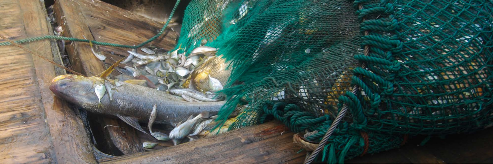
Catches on-board an industrial trawl vessel.