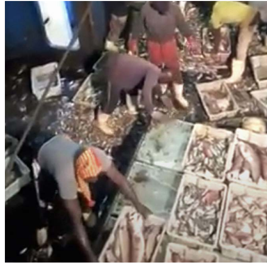
Footage of crew members sorting fish on board a Ghanaian-flagged industrial trawl vessel.