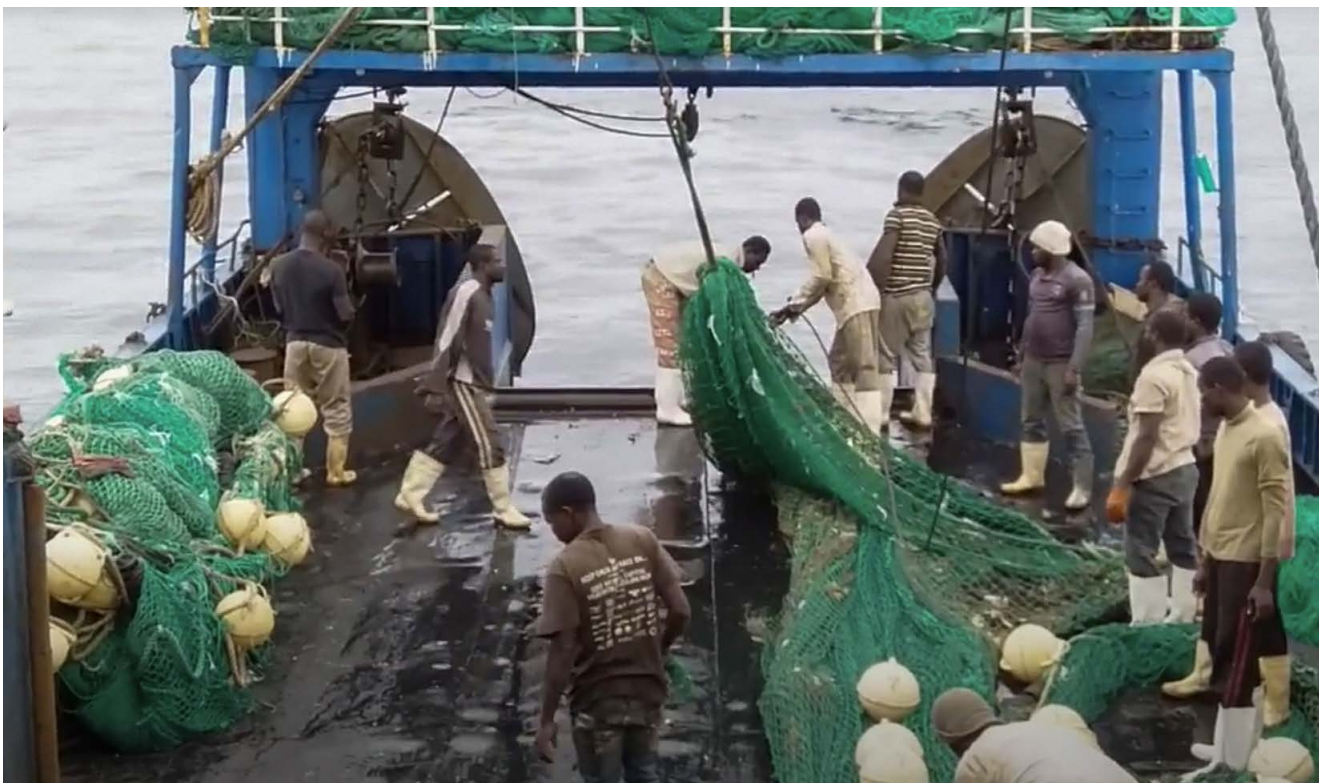
A trawl net being hauled onto the deck of an industrial trawler operating in Ghana.

The potential violation of the fundamental right to unionise has been identified not only in relation to the trawl sector, but for workers on board tuna vessels operating under the Ghanaian flag. While this research has not considered human rights or labour violations in Ghana's tuna sector, in light of the scale of tuna exports from Ghana to the EU 85 , and indications of systemic and serious abuses in other parts of Ghana's industrial fleet, this is an area requiring further scrutiny.