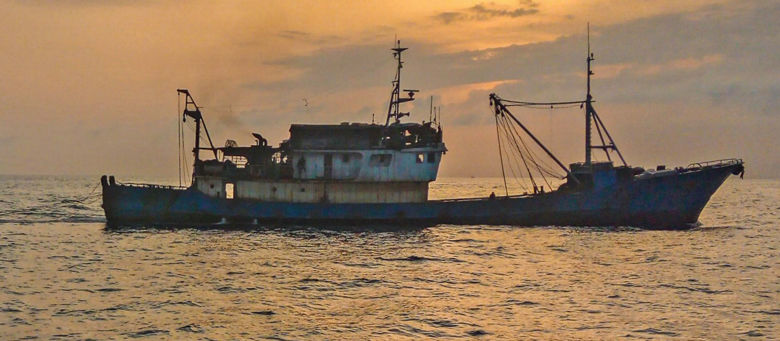
An image of an industrial trawler captured by local fishers.