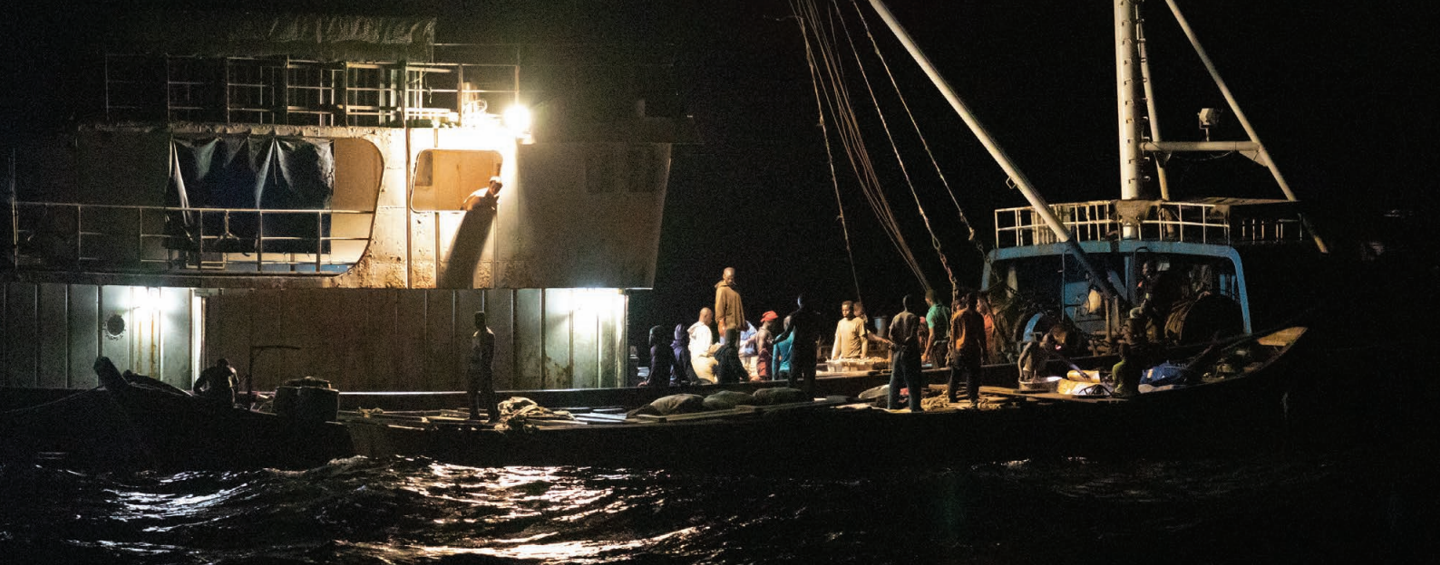
A trawler caught on film engaging in illegal trans-shipment (saiko) by EJF investigators in February 2019.