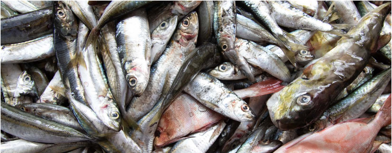
Catches landed by an industrial trawler in Ghana.