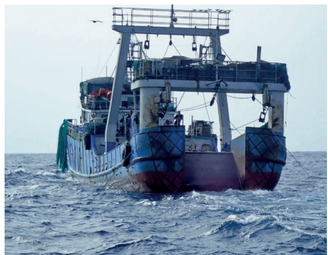
An industrial trawler operating in Ghana.

Although voluntary, the Principles were unanimously endorsed by the UN Human Rights Council in 2011 and represent an authoritative policy framework on business and human rights based on the three pillars: "protect, respect, remedy".