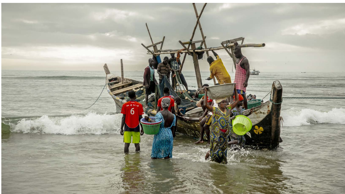
A local canoe lands fish at Gomoa Fetteh in Ghana's Central Region.

Of the 17 SDGs, SDG 8 on decent work and economic growth is particularly relevant to the rights of workers on commercial fishing vessels. The targets for SDG 8 include the protection of labour rights and promotion of safe and secure working environments for all workers (Target 8.8). Additional targets include the achievement, by 2030, of full and productive employment and decent work for all and equal pay for work of equal value (Target 8.5), and implementation of immediate and effective measures to eradicate forced labour and end modern slavery and human trafficking (Target 8.7). Improving safety and ensuring decent working and living conditions for workers on fishing vessels goes hand in hand with achieving SDG 14 on the conservation and sustainable use of marine resources, and in particular Target 14.4 on ending IUU fishing, overfishing and destructive fishing practices.