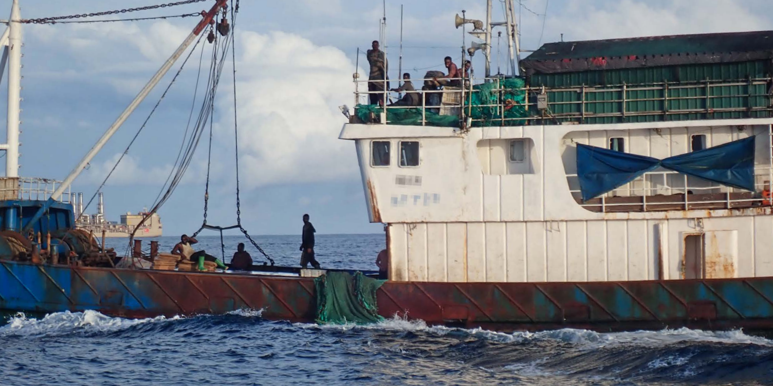
Crew members on a Ghanaian-flagged industrial trawl vessel.