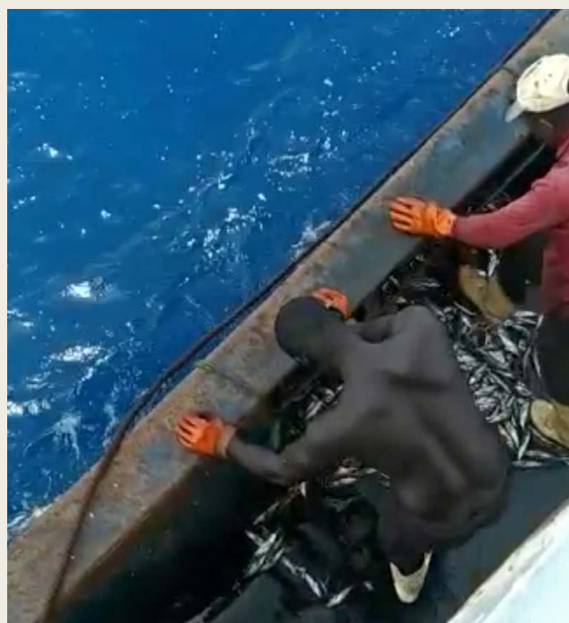
Footage of a trawler catching and discarding fish at sea. The catches appear to be juvenile fish, possibly small pelagics.