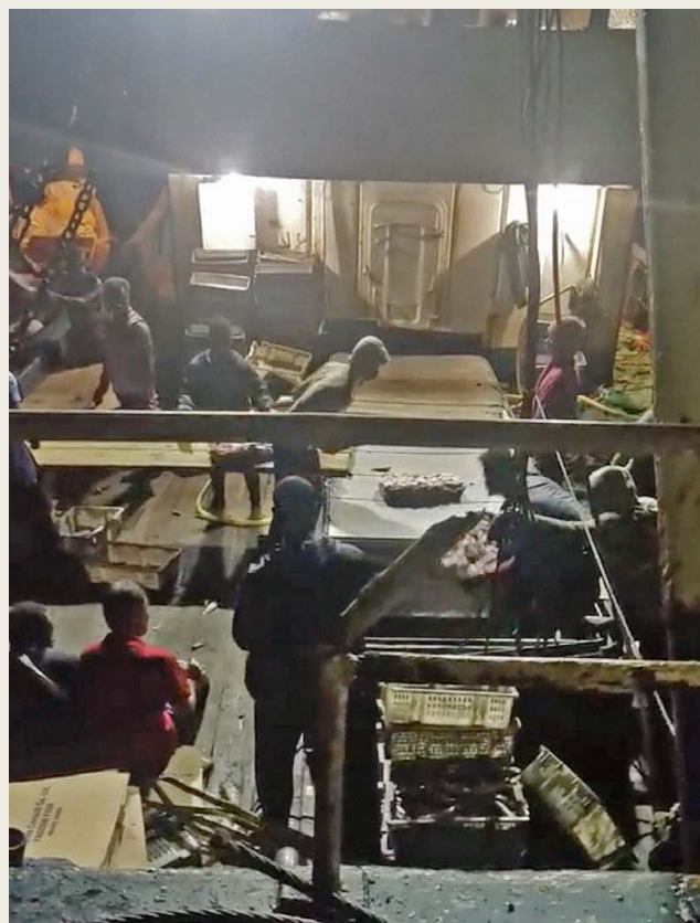
Crew members on board a trawl vessel transfer fish at sea to a waiting saiko canoe.