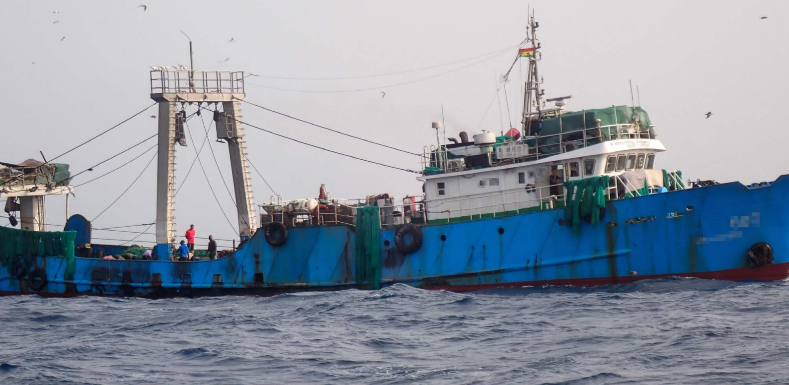
An industrial trawler fishing in Ghana.