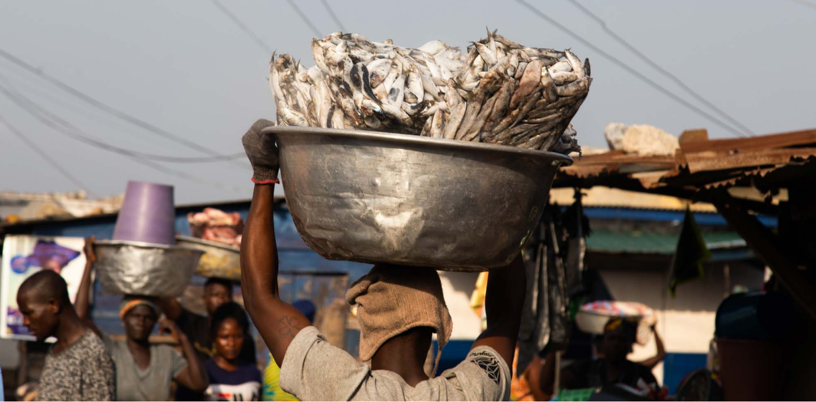
Blocks of "saiko" fish landed illegally at Elmina fish market in Ghana's Central Region.