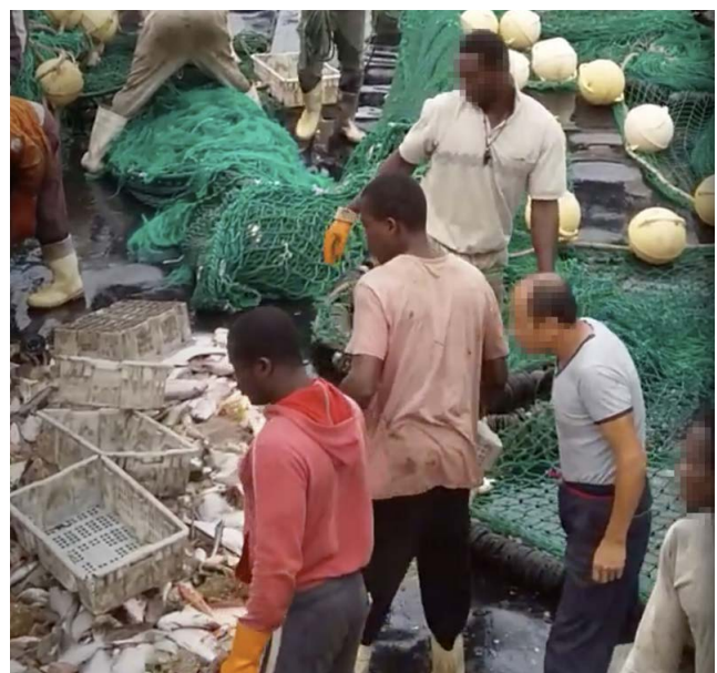
Footage of crew members hauling in the nets and sorting fish on board an industrial trawl vessel.

Observers reported having to wait up to four to six months before being paid for a trip. Respondents felt that such delays were deliberate to make them more amenable to accepting bribes ( Box 5 ).