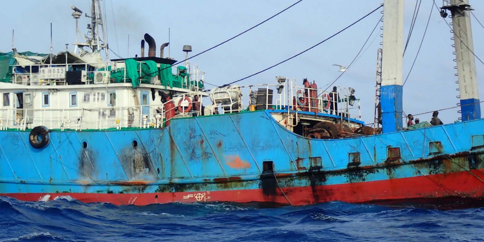
A Ghanaian-flagged trawler authorised to export seafood to the European Union.