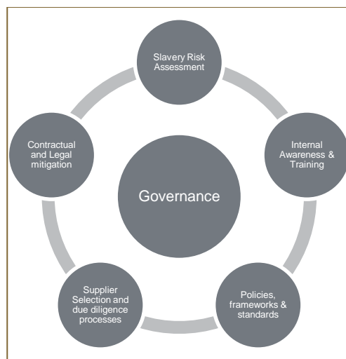
Figure 1 LSEG's approach to managing modern slavery risk

The working group ensures that we leverage a multi-faceted approach to managing our modern slavery risk, see Figure 1, right.