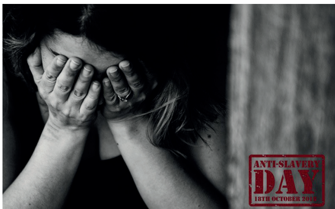
Anti-Slavery day promotion