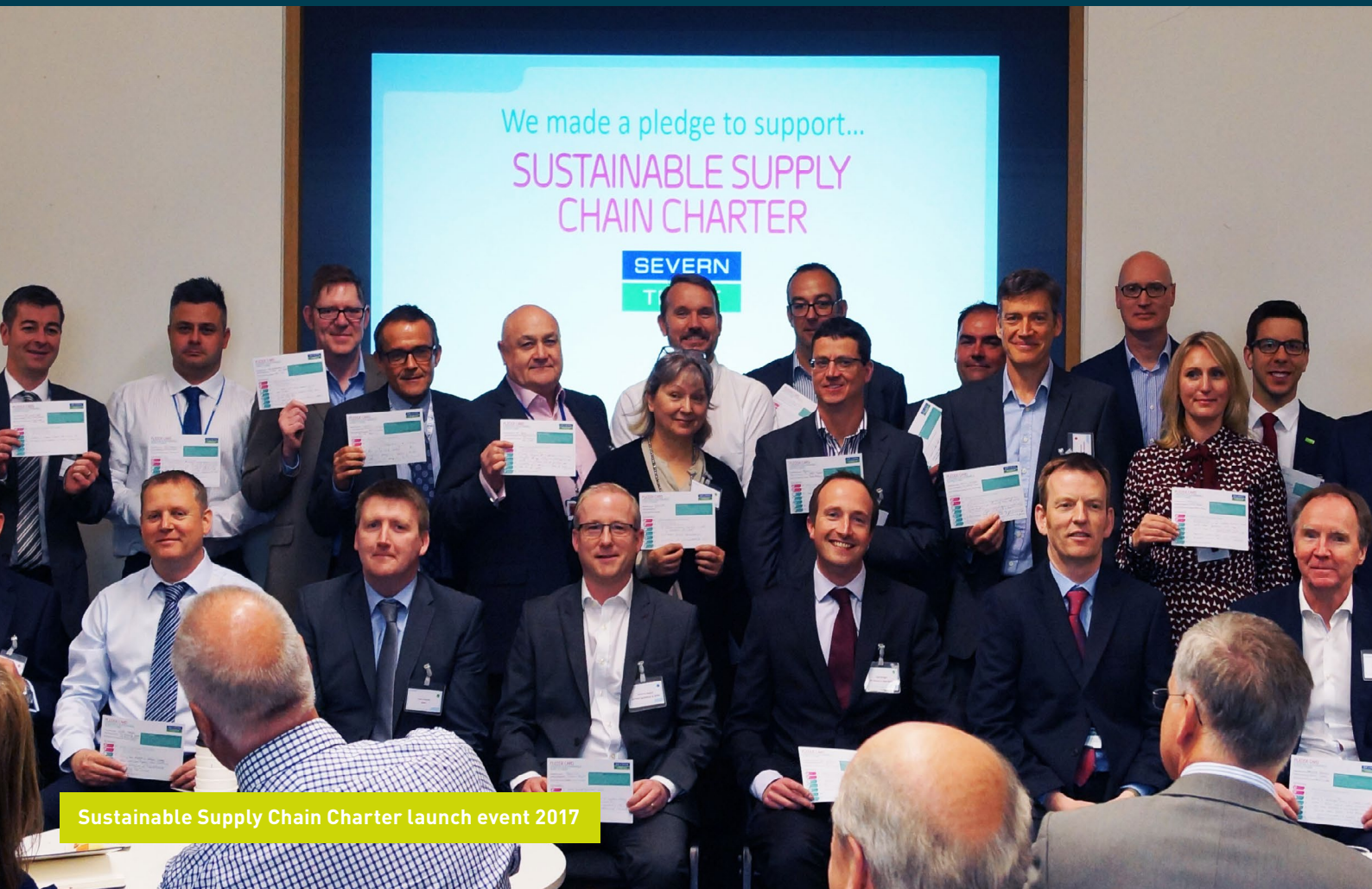
Sustainable Supply Chain Charter launch event 2017

We’ll develop our targets in 2017 and report progress to the Severn Trent Disclosure and Severn Trent Plc Corporate Responsibility Committees twice a year. We will also report on progress in our 2018 statement.