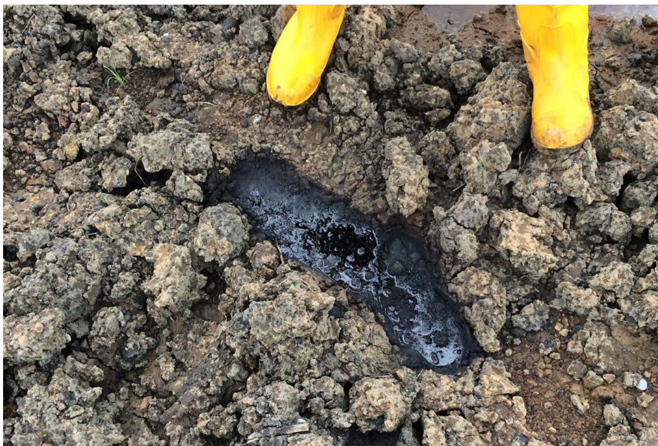
Oil contaminated land outside the Bomu Manifold

Amnesty International wrote to NOSDRA asking it to explain the basis for its certification of the remediation of the Bomu Manifold after the 2009 fire, but the agency did not provide information.