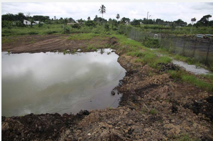
A large mound of blackened, contaminated soil, at the south side of the Bomu Manifold. Unprotected from the rain, it leaches oil into the pool. This polluted pool feeds a trench that leads towards the Barabeedom swamp. Researchers saw signs of contamination the length of the trench. August 2015