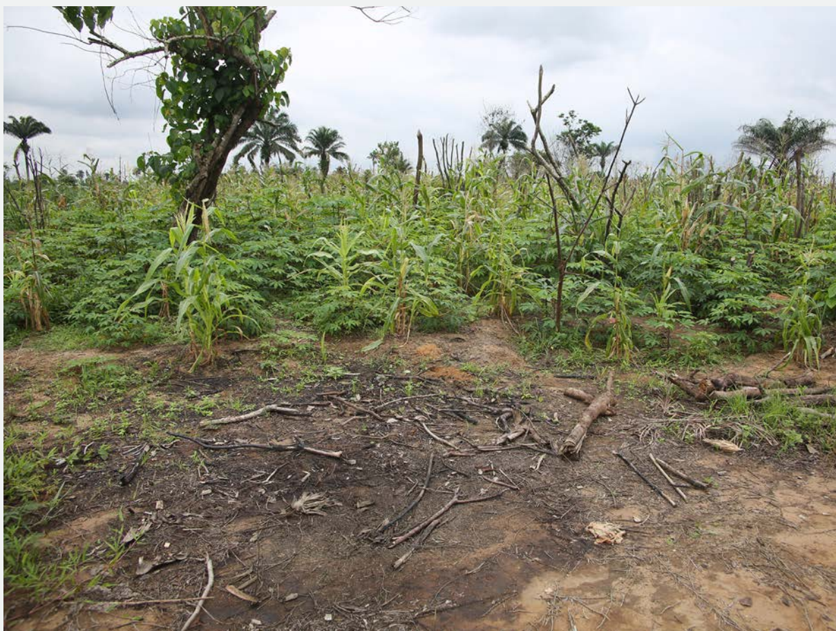
Oil has been left to soak into the ground next to a cassava field by the Shell pipeline at Okuluebu, Ogale. There is no sign of any attempt to clean it up. August 2015, © Amnesty International.