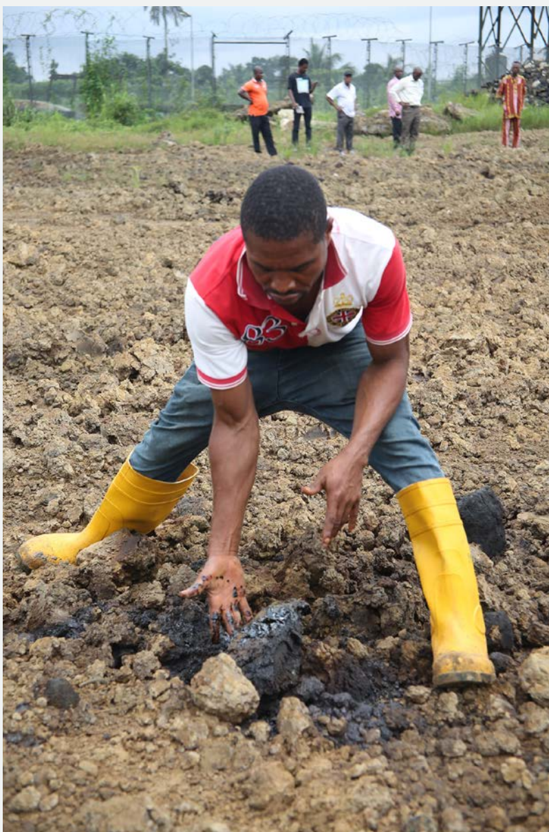
Shell claims that the area around the Bomu Manifold is clean, but the soil remains encrusted with oil. August 2015

Amnesty International wrote to Shell, asking it to provide details of its remediation attempts at Bomu, but the company did not provide any information. 77