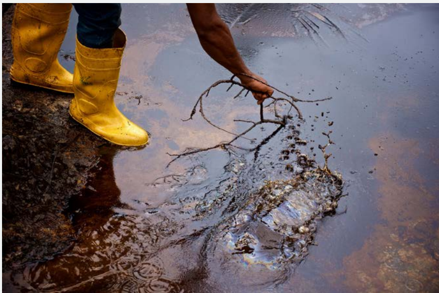
Oil contamination at Barabeedom swamp, K. Dere, September 2015

Amnesty International has written to Shell and NOSDRA asking to explain what measures have been taken to clean-up the oil pollution at Barabeedom swamp. Neither Shell nor NOSDRA provided any details.