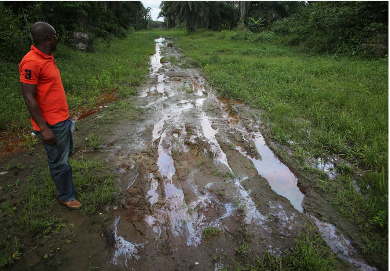
Stream at Barabeedom swamp is visibly contaminated with oil. August 2015

When UNEP investigated Barabeedom swamp in 2010, it found high levels of soil contamination, penetrating to as deep as five metres. The maximum level of soil contamination discovered by UNEP was more than eight times the level at which the Nigerian government requires intervention. 87