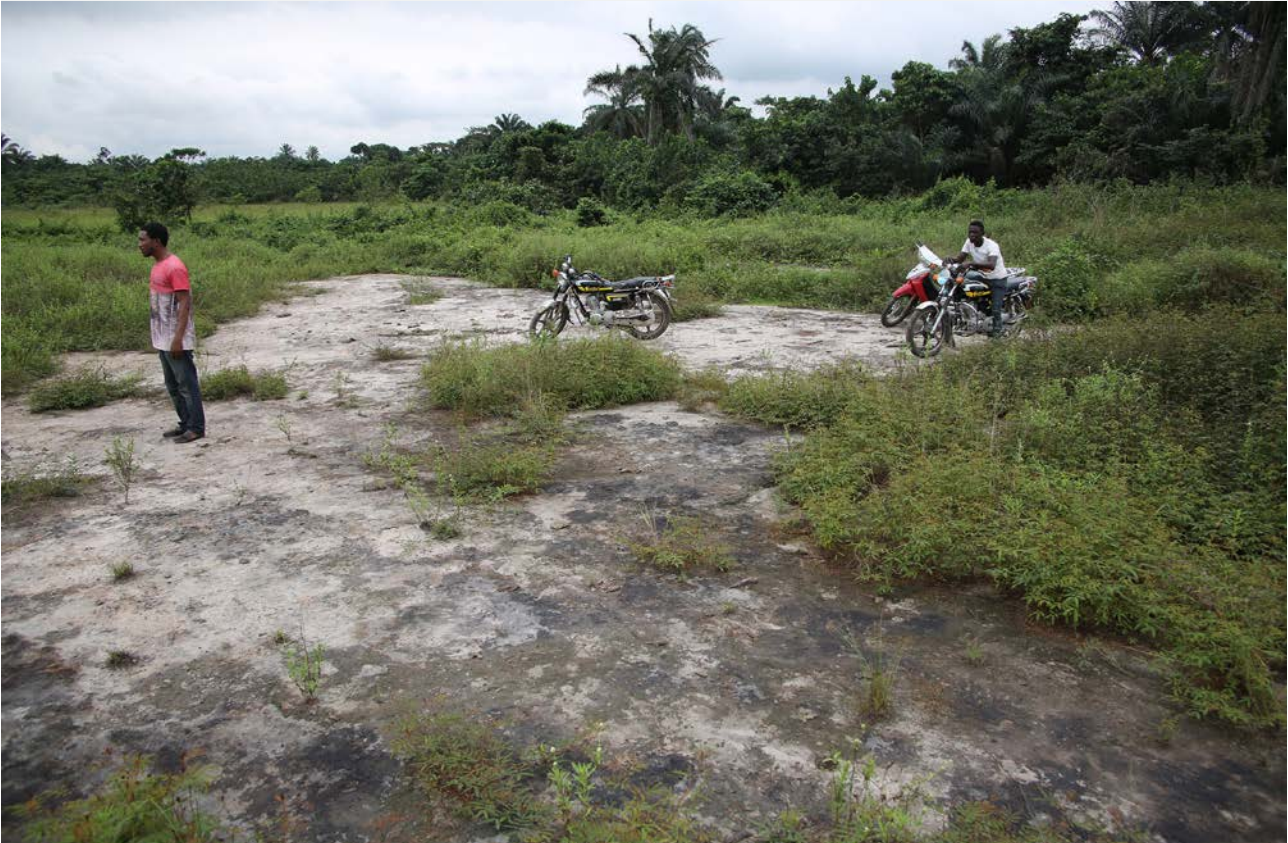
There is a strong smell of oil at Okuluebu where it has been left to soak into the ground, close to farmland and a stream. August 2015, © Amnesty International.

Okuluebu is an area of farmland, forest and swamp, about four kms north-east of Ogale town in Ogoniland. The swamp leads into a stream which flows down into the community. Pipelines belonging to Shell and the Nigerian National Petroleum Corporation (NNPC) run through the area in parallel. UNEP reported that a spill in 2009 had flowed more than 300m downhill from the Shell pipeline into the swamp at the head of the stream. There is a major risk therefore that the contamination spread downstream towards the community. 103