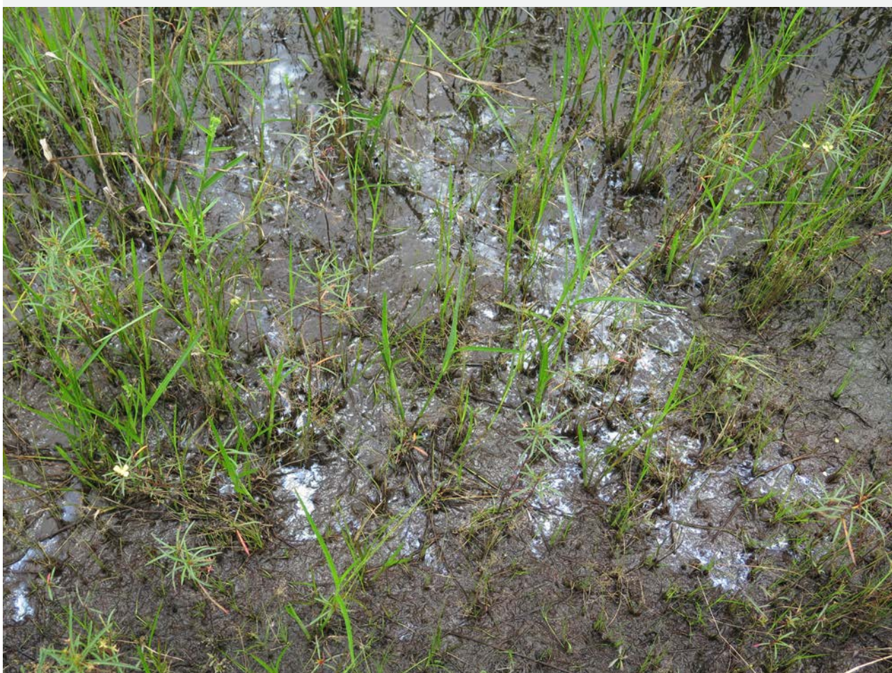
Oily sheen in the swamp at Boobanabe, August 2015. According to Nigerian government regulations, there should be no oil in water after 60 days. The spill at Boobanabe took place in 1970.

As with the other cases, Amnesty International has requested information from Shell and NOSDRA regarding this site, but did not receive any.