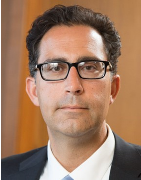
District Judge Vince Chhabria https://www.cand.uscourts.gov/vc