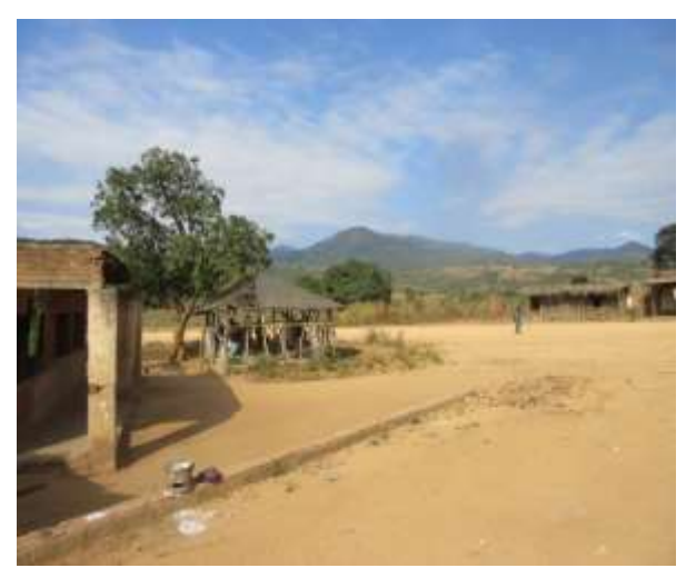
Boozing Den in operation