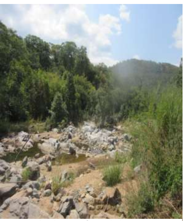
Sere River at low dry season flow at discharge point