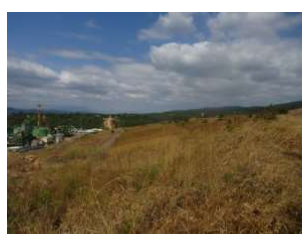
Successful Revegetation at the Mine