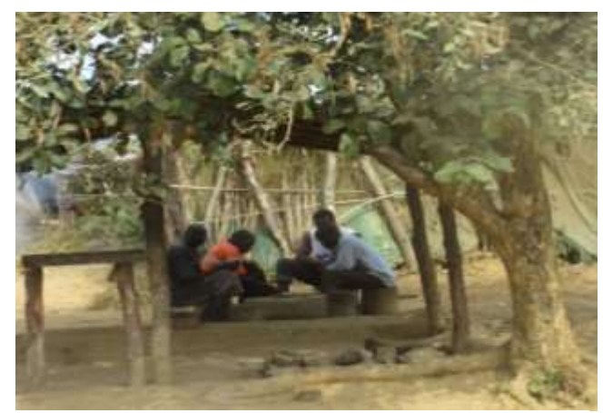
FIGURE 12 YOUNG UNEMPLOYED MEN PLAYING A BOARD GAME

Wages at Kayelekera remain high by local standards. A small surface coal mine (owned by MalCoal Mining Ltd. a subsidiary of the Australian Intra Energy Corporation Limited) has opened in the area, and people generally compared it unfavorably with Paladin. Paladin's wages are a multiple of the coal mine's. While the coal mine has provided some jobs and some help to the local economy, they are too few and low-paying to make up for the loss caused by Paladin's non-operating layoffs. Describing the difference