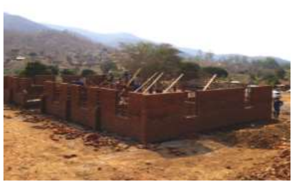
Progress - Kayelekera Clinic - Sept 2015