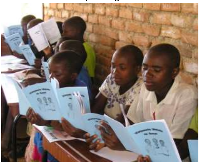
FIGURE 2 STUDENTS WITH PALADIN'S PUBLIC HEALTH READERS

By 2015, the political and economic situation was stable, but poor. The Cashgate scandal was continuing to negatively impact Malawi's donor income and national budget. The national currency lost significant value and