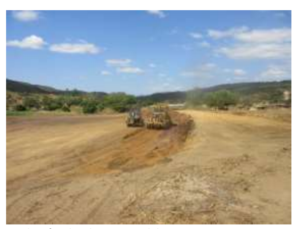
Grading for the clinic in Kayelekera, June 2015