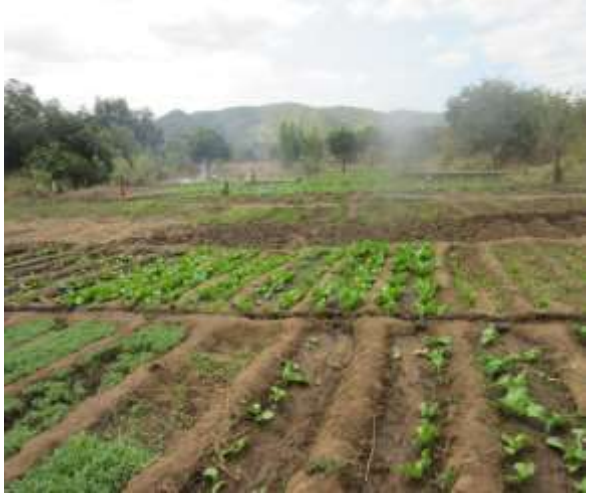
FIGURE 11 PRODUCTIVE IRRIGATED CO-OP

department. Their income is an extremely important contributor to the economic strength of the community. Even on care and maintenance this amounts to MKw 65 million (US$145,000) a