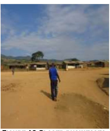
FIGURE 10 CLOSED BUSINESSES IN TOWN

Putting the mine on care and maintenance has had a notable, negative effect on the local economy. A significant proportion of small businesses have closed. The market in Kayelekera is minimal. However, the local economy remains much stronger than it was before the mine opened, when there was almost no formal economic activity. "Before Paladin came we had nothing," on long-term resident said. "With the coming of the mine the people's lives have changed. Look at the clothes we wear. It used to be rags. It will be rags again if the mine closes down," said another. The employment of over 200 Malawians at the mine includes a high proportion of locals, particularly in the security