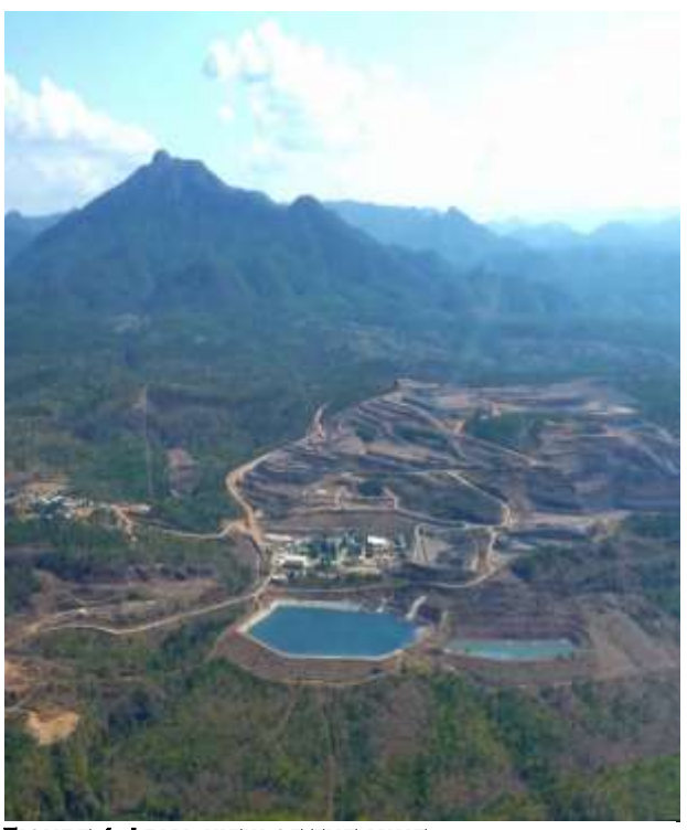
FIGURE 1 ARIAL VIEW OF THE MINE

had not recovered. President Peter Mutharika was in power and generally unpopular. The Kayelekera Mine was on "care and maintenance" which means is it not processing ore, but kept in a condition so that it can be reopened if the price of uranium recovers. The price of uranium hit a low of under US$ 30/lb. in 2013 and had risen to US$ 36/lb. at the time of this report; it was nowhere near the US$ 70/lb. price it had reached 2011. The economy of Malawi remained weak, with a continued lack of foreign investment or significant expansion of