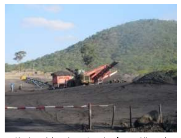
MalCoal Kayelekera Operation, view from public road