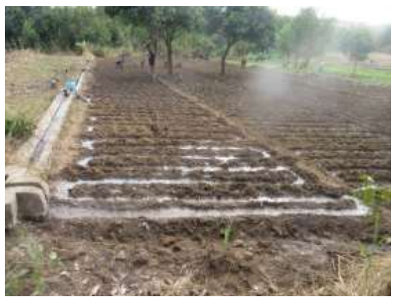
Successful Irrigation System provided by the Mine now used by farmers coop