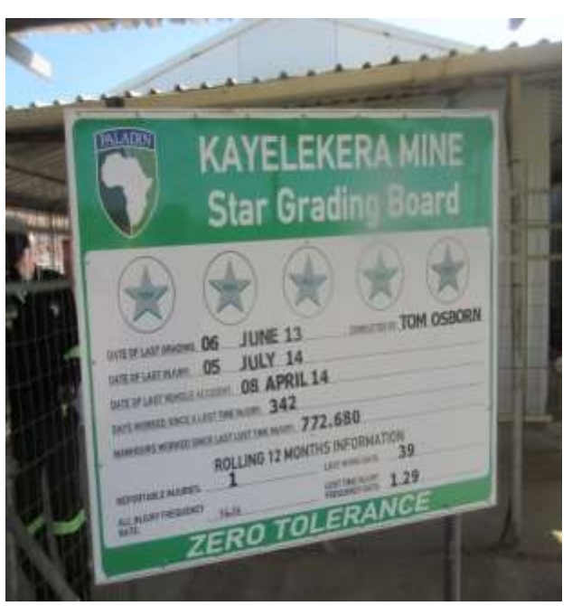
Kayelekera Mine Injury Board