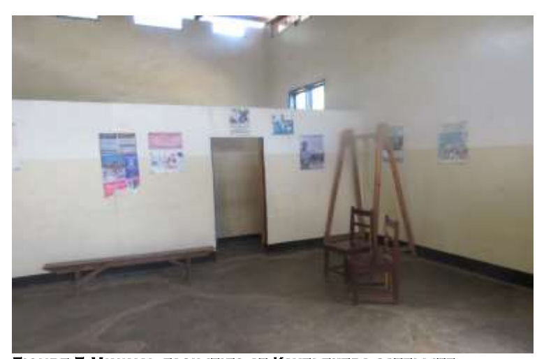
FIGURE 7 MINIMAL FACILITIES AT KAYELEKERA SATELLITE DISPENSARY