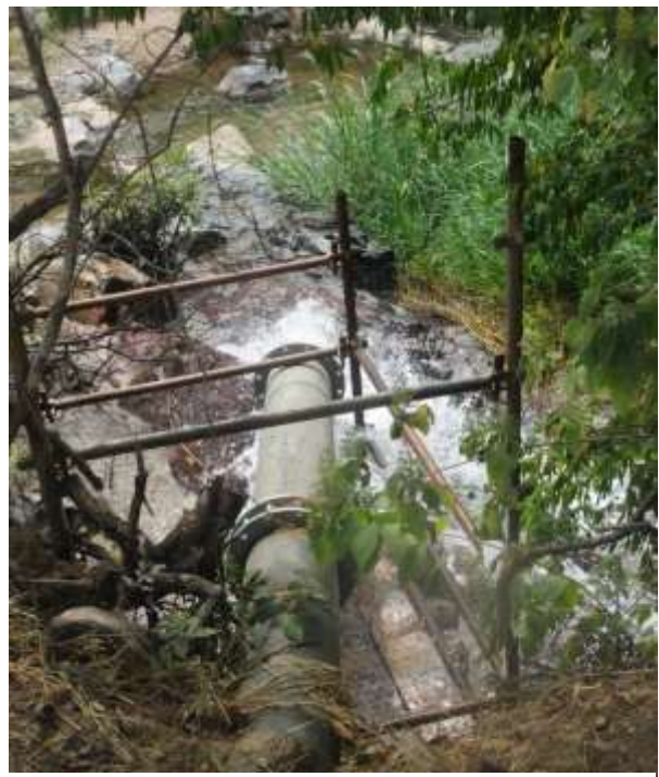
Discharge from the Sere River to the Mine's treatment Plant