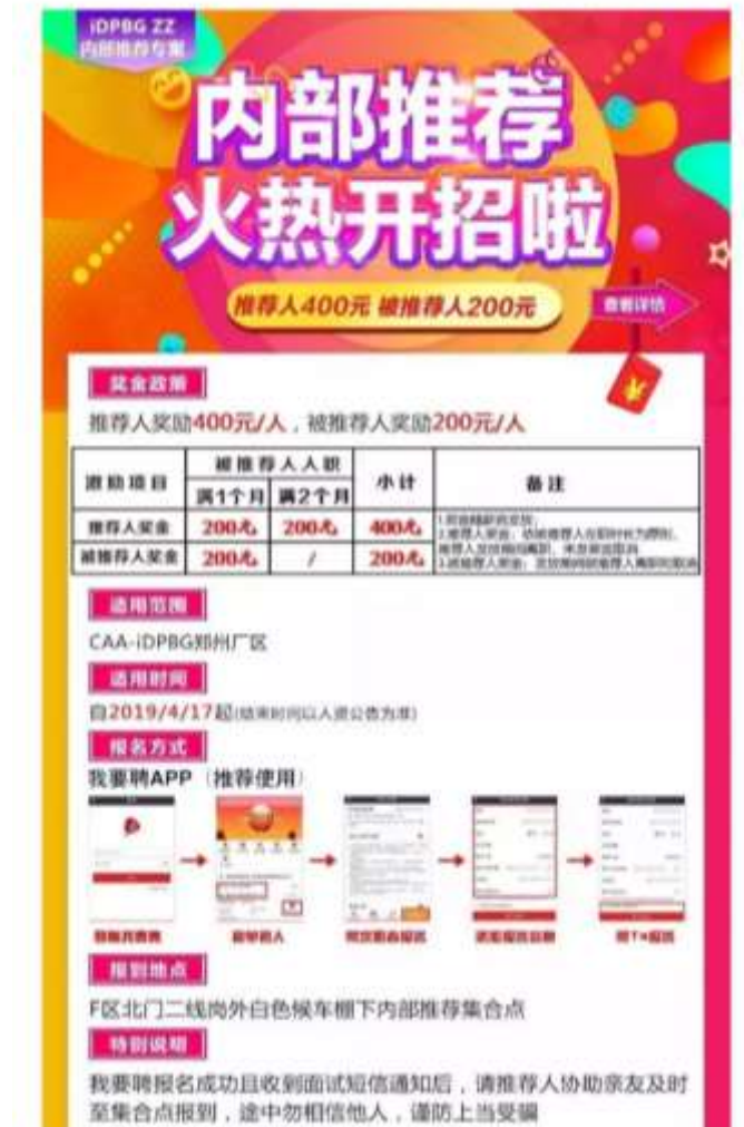
(Internal references program)

When the factory is in urgent need of workers, referring others to work at the factory is mandatory. Every department in the factory has its own referral quotas that are allotted to every worker. The supervisors of these departments will evaluate workers' grade based on the referral quotas. If a worker refuses to refer others to work at the factory, they will receive fewer overtime working hours in the following weeks. Fewer overtime hours is seen as a punishment for many workers, as the base wage is pittance. When the program first started in 2015, there was no requirement for workers to refer others to the factory. However, from 2016 onwards, the factory now gives out quotas, and each line is now required to refer six or seven individuals into the factory. Referral quotas increase when there are more workers on the production line.