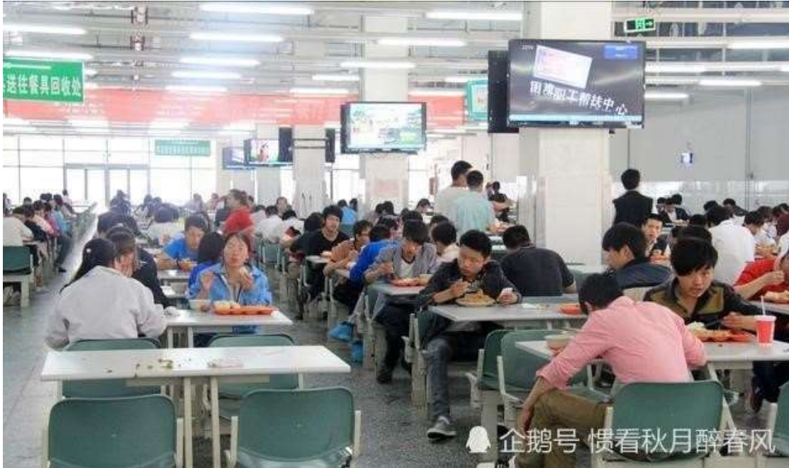
(The dining hall)

Workers have to dine in batches because there is a multitude of people coming to the dining hall for lunch. The queue of people waiting to order food is extremely long every day. The meals currently are not cheap and even more expensive than the outside restaurants. Therefore, many workers do not eat anything or just eat some snacks during lunch time. They only have a meal after work. The sanitary condition of the dining hall is unsatisfactory. The tableware is public and has not been replaced for a long time. Some workers use their own chopsticks. Workers need to return the tableware to the tableware station after they finish their meal. In August 2019, the investigator found there was hardly any meat in the dishes.