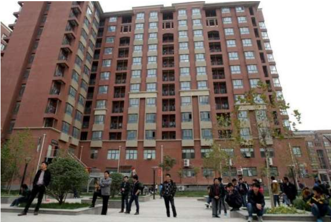
(Workers sitting outside of the dormitory)

Workers can live outside the factory and the factory neither charges an accommodation fee nor do they provide an accommodation subsidy. Most workers who choose to live outside live in an area northeast of the factory where there is a place called “Zhang Zhuang Zhen” which has apartment buildings. Each room is approximately a dozen square meters and has a separate bathroom. The monthly rent is around 300 RMB ($42). The air-conditioned rooms are a little more expensive than normal rooms. Utilities are paid by tenants although water is free generally. Each room has an independent electric meter. The monthly utility fee totals approximately 100 RMB ($14). Tenants can also cook in the room.