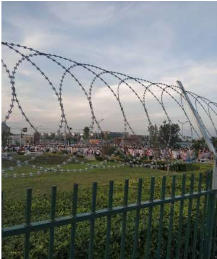
(Wires above factory fences)

The investigator asked the workers why they choose to work here. “Life is hard. At least this factory can guarantee to pay us on time. The only bad thing is the long off-peak season where we can only earn 3,000 RMB ($420) per month without overtime work.”