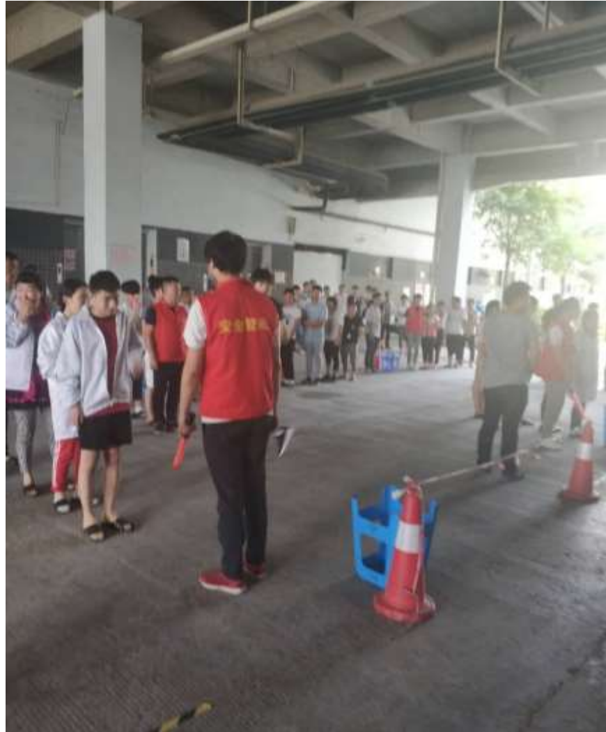
(Workers practicing fire drill)

The factory requires the workers to pass the fire safety tests every year. Nevertheless, the factory does not provide a single training class on fire safety and other relevant knowledge besides a half-day training session during the new workers' orientation/training. There is a classroom inside the workshop, where the line managers will ask workers in two lines to exchange signatures to prove that they have been trained, although they have never participated in the training. Workers are unsure about where their credits come from. The regular workers' credits are completely fraudulent.