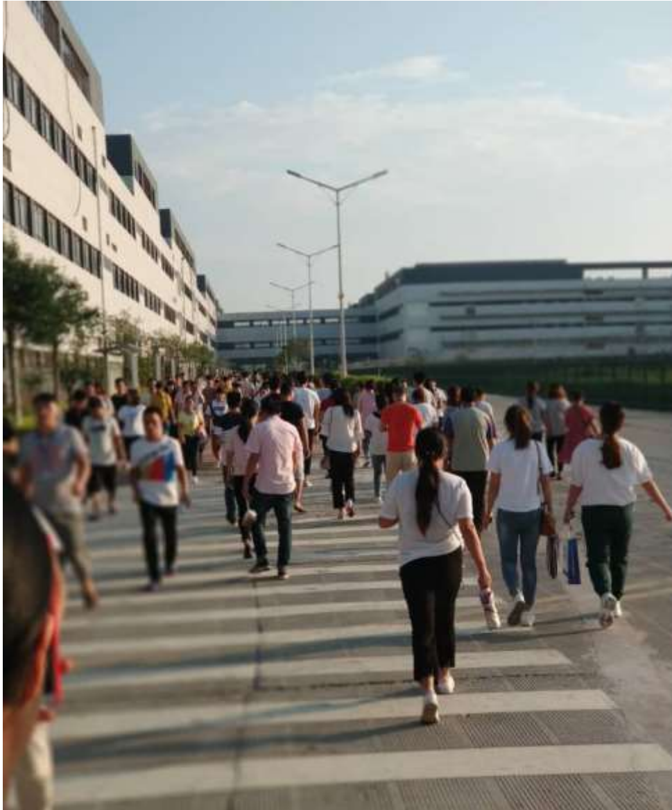
(Workers switching shifts in the morning)

Workers begin to work the next day and after gathering at the entrance of the workshop, line leaders from the workshops then select workers for their line. Worker’s factory ID cards have been authorized to enter the factory the day before. They follow the instruction of line leaders and begin working in the workshop.