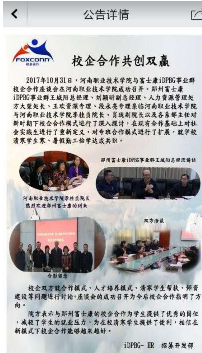
(Notice of “School-Enterprise cooperation”)

In 2019, most of the student workers are recruited by dispatch companies. Student workers who are hired through dispatch companies need to work overtime and night shifts like regular workers. During the investigation period in 2019, the investigation found a large number of student workers in the Foxconn factory. Some were arranged by their schools to come and some came to work at the factory themselves. Most of the student workers plan to leave the factory in September before the new semester starts.