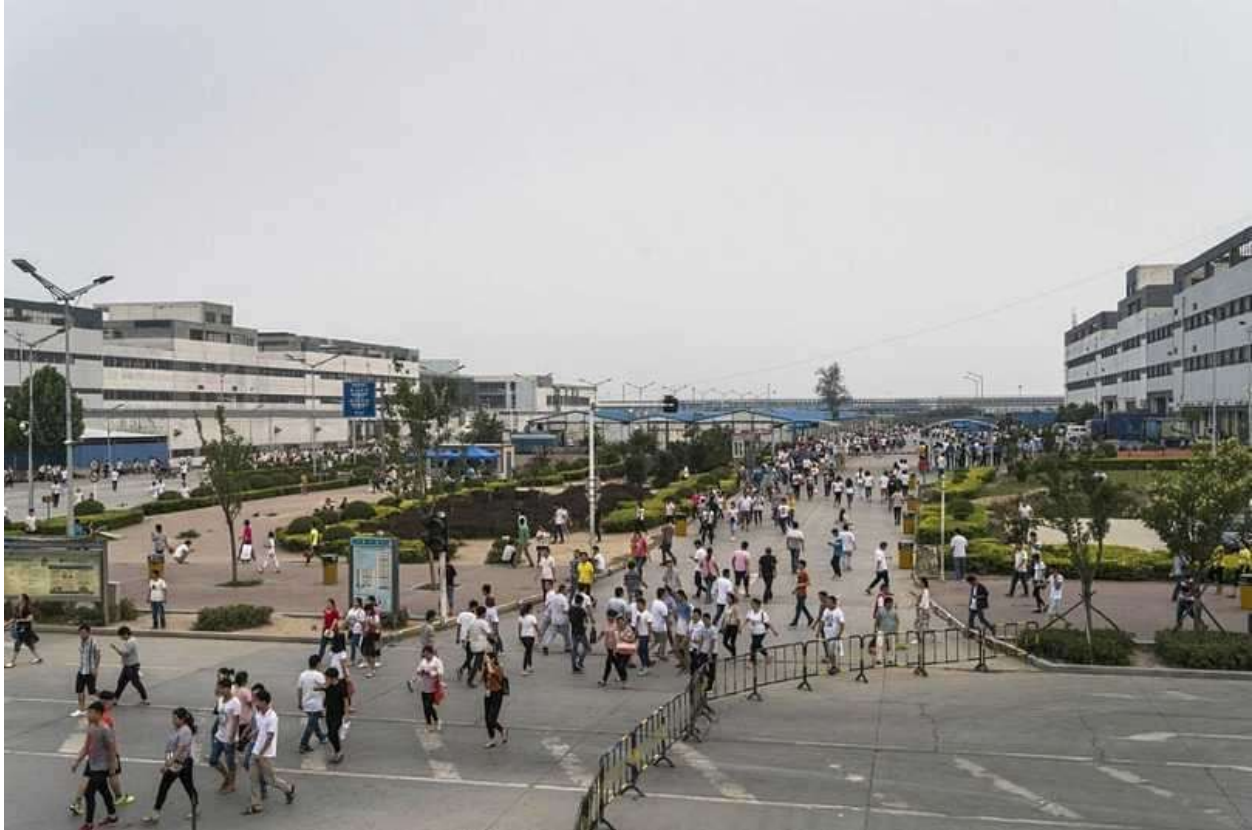
(Inside of the factory)

The factory covers about 1.4 million square meters and by the end of 2011, construction for supporting facilities in and around the factory was completed. The factory has developed production lines manufacturing casings, motherboards in addition to product assembly and after-sales maintenance. It has become the largest iPhone manufacturing factory in the world. People even call the Airport Economic Zone, where the factory is located, the “iPhone City”. During peak season in 2017 and 2018 (usually from August to November), the factory employed over 300,000 workers. The factory had around 60,000 workers in 2018 during off-peak season. In 2019, the factory is recruiting a large number of workers, and in August there were over 150,000 workers. The investigator estimates that the ratio of male to female workers is 4:3 in the workshop and the ratio of male to female technicians is 5:1. Among line leaders and team leaders in the workshop, the male to female ratio is 10:1 and 30:1 or even higher at the managerial level and above. The majority of the workers are from towns and counties in Henan province and there are rarely workers from other provinces.