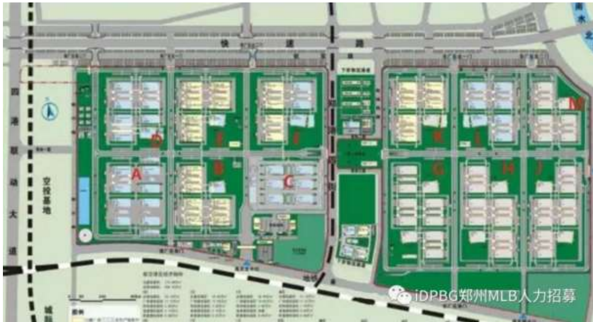
(Map of the factory)

The two business groups are then divided into smaller factory zones based on their geographic location for management purposes. These zones are named alphabetically from A to N (except I). Zones H, M, J were planned to be used as factories but have yet to be built. The administrative structure of Foxconn Zhengzhou from bottom to the top are: Production Lines, Sections, Departments, Business Units, Business Divisions, Business Groups, and Foxconn Group.