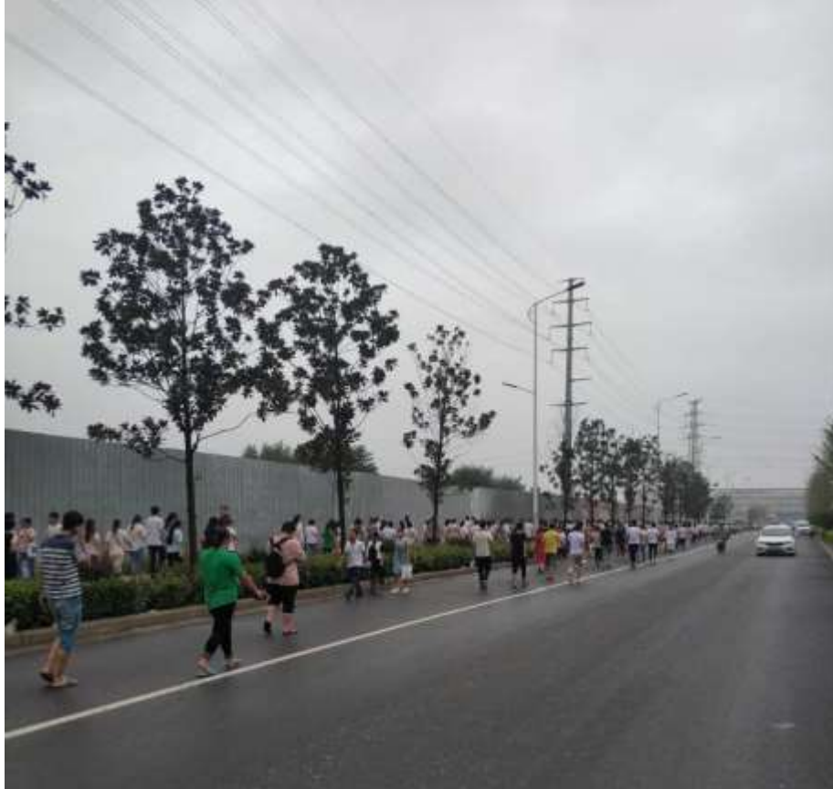
(Day shift workers go to work)

In 2015, the factory received many orders and the iPhone 6 was selling well. Workers in several workshops in the F department were working 30 days and only had one day off a month. In the second half of the year, orders for the iPhone 6s were also stable and it was only until December 2015 when overtime was reduced and workers were resigning from the factory. Many workers mentioned that 2017 was not a good year for the factory, and workers generally did not work overtime in the first half of the year. Usually, peak season begins in August, however, in August 2017, workers were generally putting in around 20 overtime hours a month or less. Workers were complaining that the factory wasn't giving them overtime work, and according to some line leaders, there were some issues encountered when manufacturing the "iPhone X", hence there was a delay in the production of the device. This led to many workers choosing to resign.