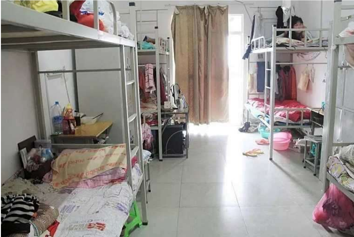
(Inside of female dormitory)