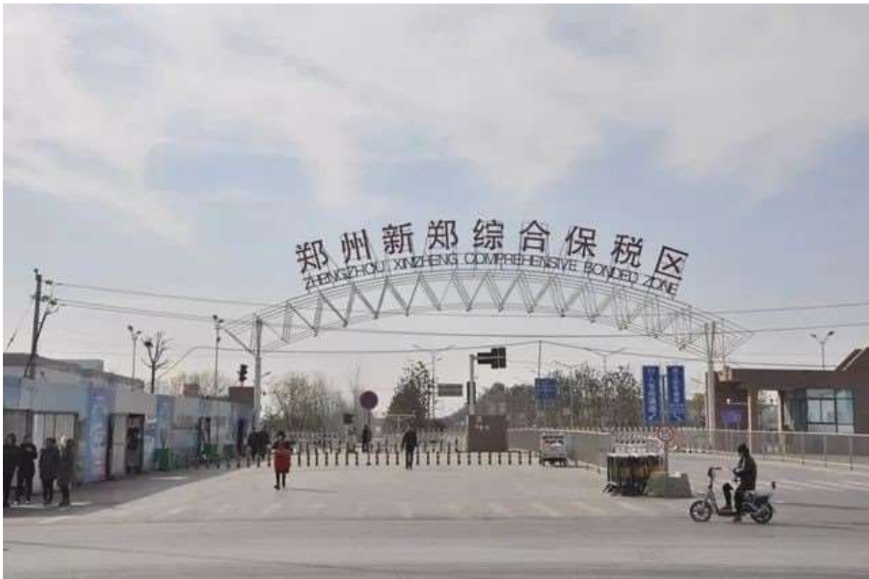
(Outside of the front gate of Zhengzhou Foxconn factory)

This investigative report is based on the labor conditions inside Hongfujin Precision Electronics (Zhengzhou) Co., Ltd. (hereinafter, “the factory”).