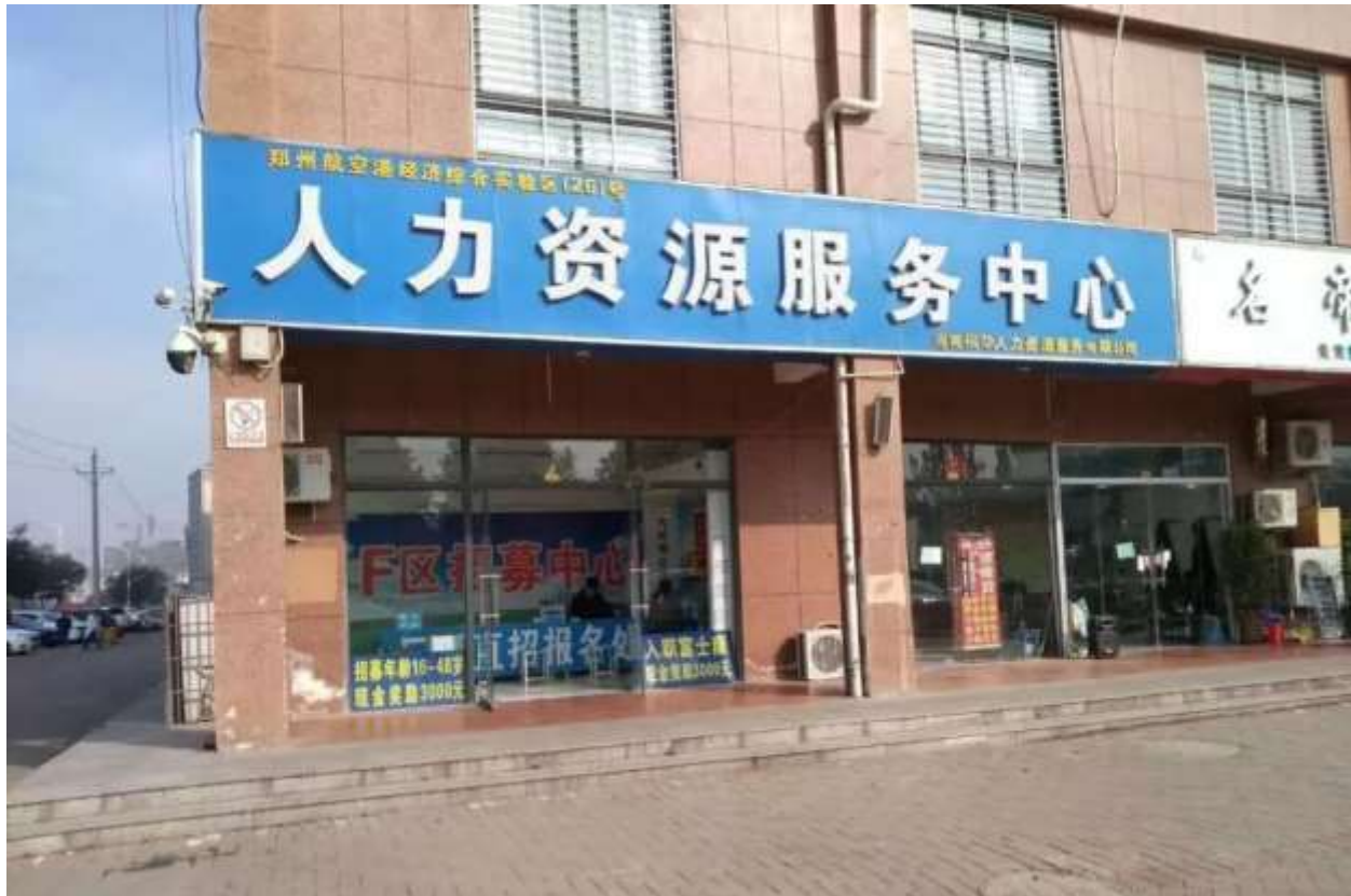
(Outside of the dispatching company)

Afterwards, everyone was handed an ‘interview registration form’, where they filled in their name, including name, gender, identification number, phone number, education level, and previous job experiences. Under the education level category, the investigator was told to write they graduated from junior high school or high school as the factory does not accept college graduates. Workers were also told to write that they were applying for a position as a regular worker, although workers could choose to apply to be a regular worker, forklift worker, or work in production management and service logistics etc.