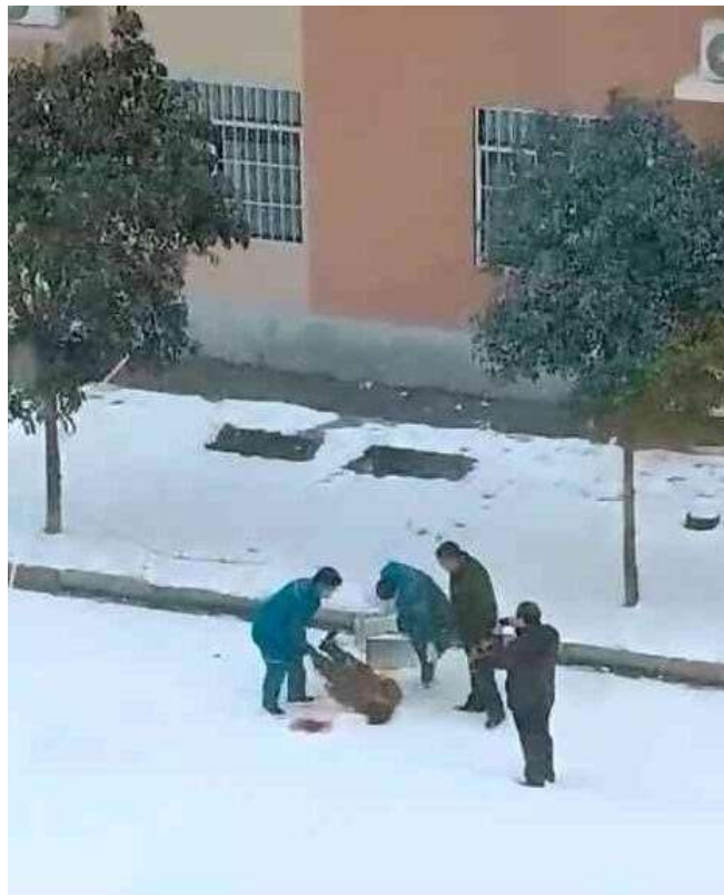
(A worker jumped to his death from Fu Hang building)

On January 6, 2018, a dispatch worker jumped to his death from Zhengzhou Foxconn’s Fu Hang Apartment complex. It was suspected that the worker committed suicide because he had not received his bonus. The factory reasoned that the worker owed large amounts of debt that he was unable to repay and began having suicidal thoughts which led to his suicide.