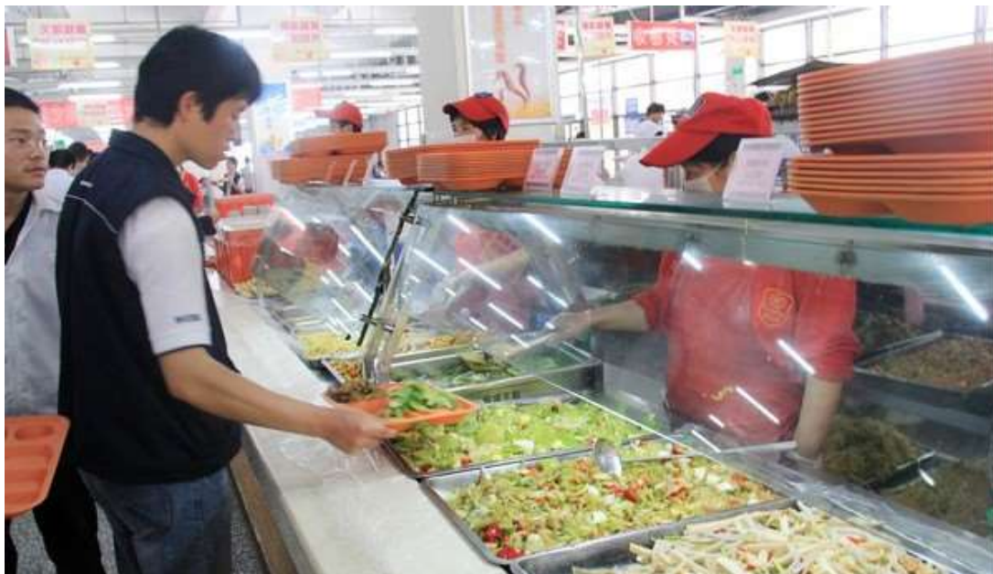
(Workers getting food)

Workers have to dine in batches because there is a multitude of people coming to the dining hall for lunch. The queue of people waiting to order food is extremely long every day. The meals currently are not cheap and even more expensive than the outside restaurants. Therefore, many workers do not eat anything or just eat some snacks during lunch time. They only have a meal after work. The sanitary condition of the dining hall is unsatisfactory. The tableware is public and has not been replaced for a long time. Some workers use their own chopsticks. Workers need to return the tableware to the tableware station after they finish their meal. In August 2019, the investigator found there was hardly any meat in the dishes.