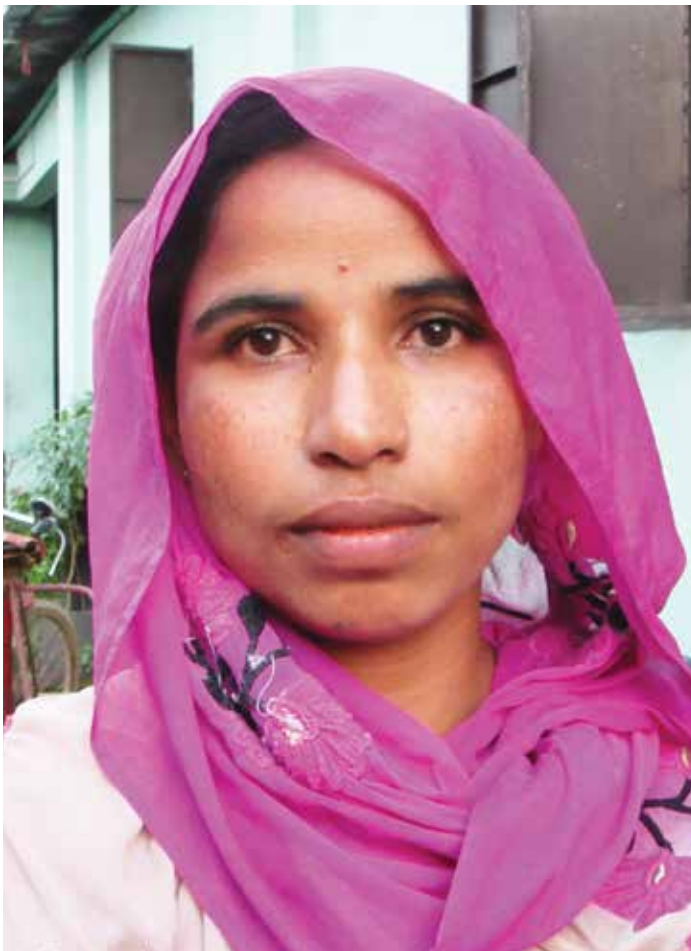
A Rana Plaza survivor in her community.

Accord addresses issues of financing and brands' commitment to maintain their volumes of sourcing. On the financing of mandated factory repairs and renovations, the wording remains flexible. On sourcing, the Accord states that the signatories are committed to long-term sourcing relationships with Bangladesh, which requires them to continue business at order volumes comparable to or greater than those that existed in 2013 for the duration of the Accord. While for labor groups this aimed to prevent companies from "cutting and running" from a particular factory, many signatory companies seemed to interpret this as meaning the volume requirement is applied to Bangladesh as a whole and not to individual factories.