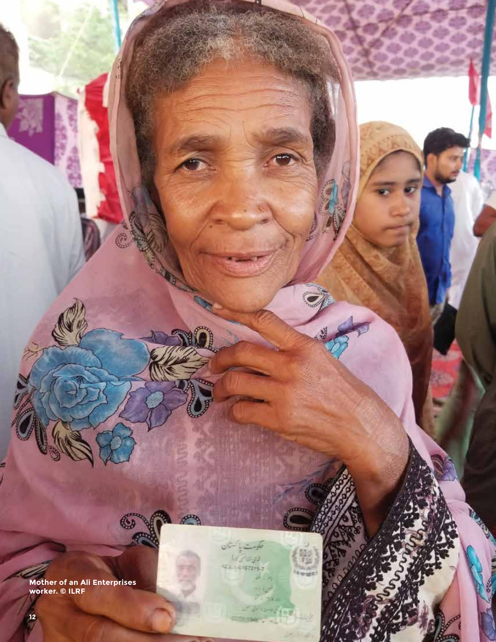
Mother of an Ali Enterprises worker.