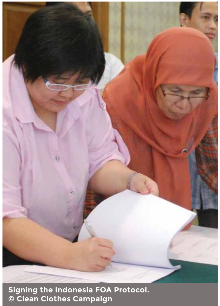
Signing the Indonesia FOA Protocol.

These models are significantly different from the failed corporate-led codes and auditing systems and they chart important ways forward in addressing the root causes of poor working conditions and labor rights violations. Unlike traditional CSR, these worker-led models address the challenges of labor rights and working conditions by requiring checks and balances of power on one end of the supply chain, and by strengthening workers' ability to engage on the other.