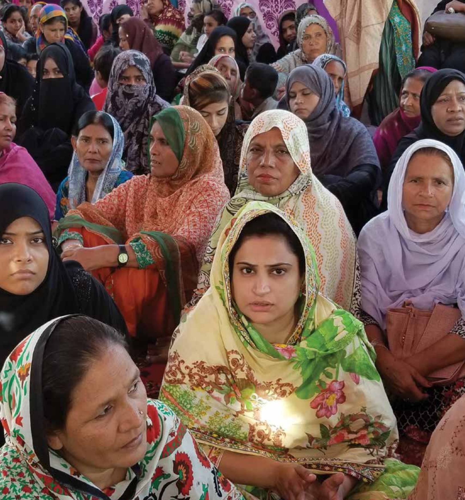
Family members gathered in front of Ali Enterprises factory building on 6th anniversary of the fire.