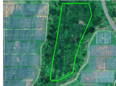
North Area Reforestation

Additionally, the project has participated in community reforestation campaigns with 10,000 fruit trees planted in our neighboring communities. In 2023, 1,000 fruit trees were donated to be planted in different areas of the basin in Namasigüe.