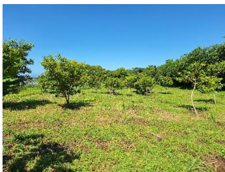
Fruit trees planted

Additionally, the project has participated in community reforestation campaigns with 10,000 fruit trees planted in our neighboring communities. In 2023, 1,000 fruit trees were donated to be planted in different areas of the basin in Namasigüe.