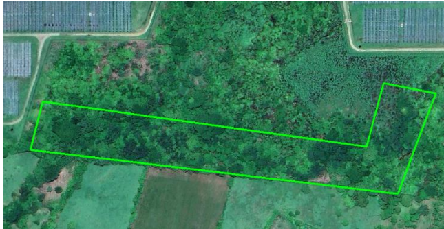
South Area Reforestation