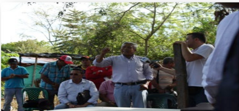
Community of Puerto Seco – Huila, Ombudsman's Office Photo Archive - Colombia (2016)

Colombia in the District of Huila and it partially covers approximately seven municipalities of this area. It is near the Magdalena river (Colombia's longest river), in the Colombian Macizo, that was declared a biosphere reserve by UNESCO in 1979. 11 El Quimbo has an installed capacity of 400 megawatts, with an average energy production estimated at 2,216 GWh per year. The environmental licence for the project was given in 2009. 12 Construction started officially in the same year following which, the company commenced operational activities.