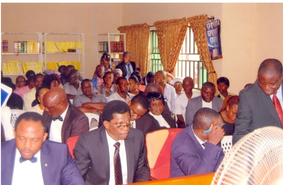
Pictures above: Sittings of the Special Investigation Panel on Oil Spills and Environmental Pollution of the NHRC of Nigeria