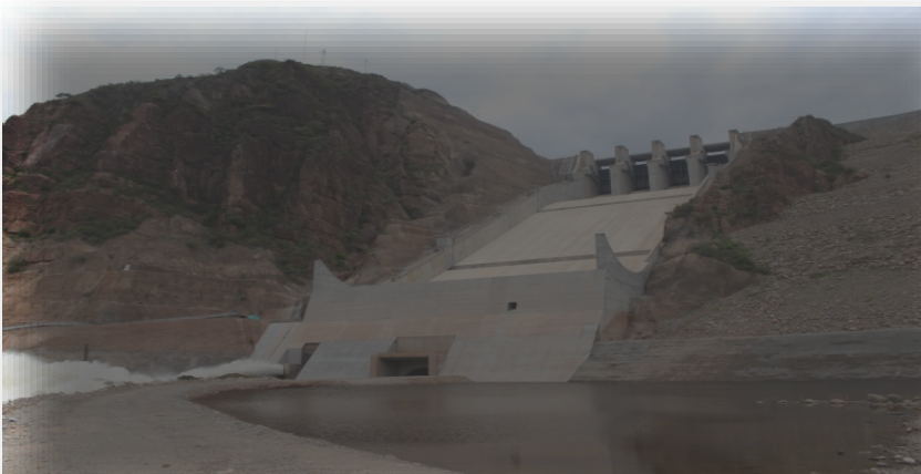
El Quimbo Dam, Ombudsman's Office Photo Archive - Colombia (2016)

By Sandra Rodriguez, Ombudsman's Office of Colombia