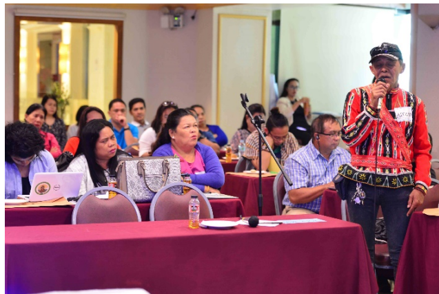
A tribal chieftain sharing his experiences at a community dialogue in Malaybalay City, Bukidnon Province