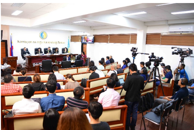
Scene at the first inquiry hearing of the Commission on Human Rights of the Philippines National Inquiry on Climate Change