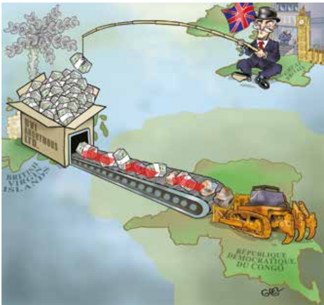
'Out of Africa' cartoon.

The BVI – Gertler's offshore jurisdiction of choice – is most often described as a tax haven. In addition, however, it is also a provider of secrecy. When the World Bank looked at more than 200 cases of grand corruption, over 70 per cent involved at least one anonymous company used to try to disguise the real owners and facilitate their crimes. The UK's Overseas Territories were the most-used jurisdictions; the BVI alone came in second on the list. 33