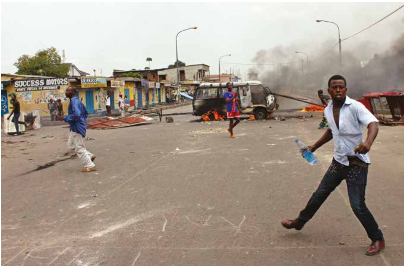
Anti-government protestors during a January 2015 protest against a new law that could delay 2016 presidential elections in Democratic Republic of Congo.

There is a very real risk that the limited progress Congo has made will backslide in the run up to the election, if deals such as these are struck without appropriate scrutiny.