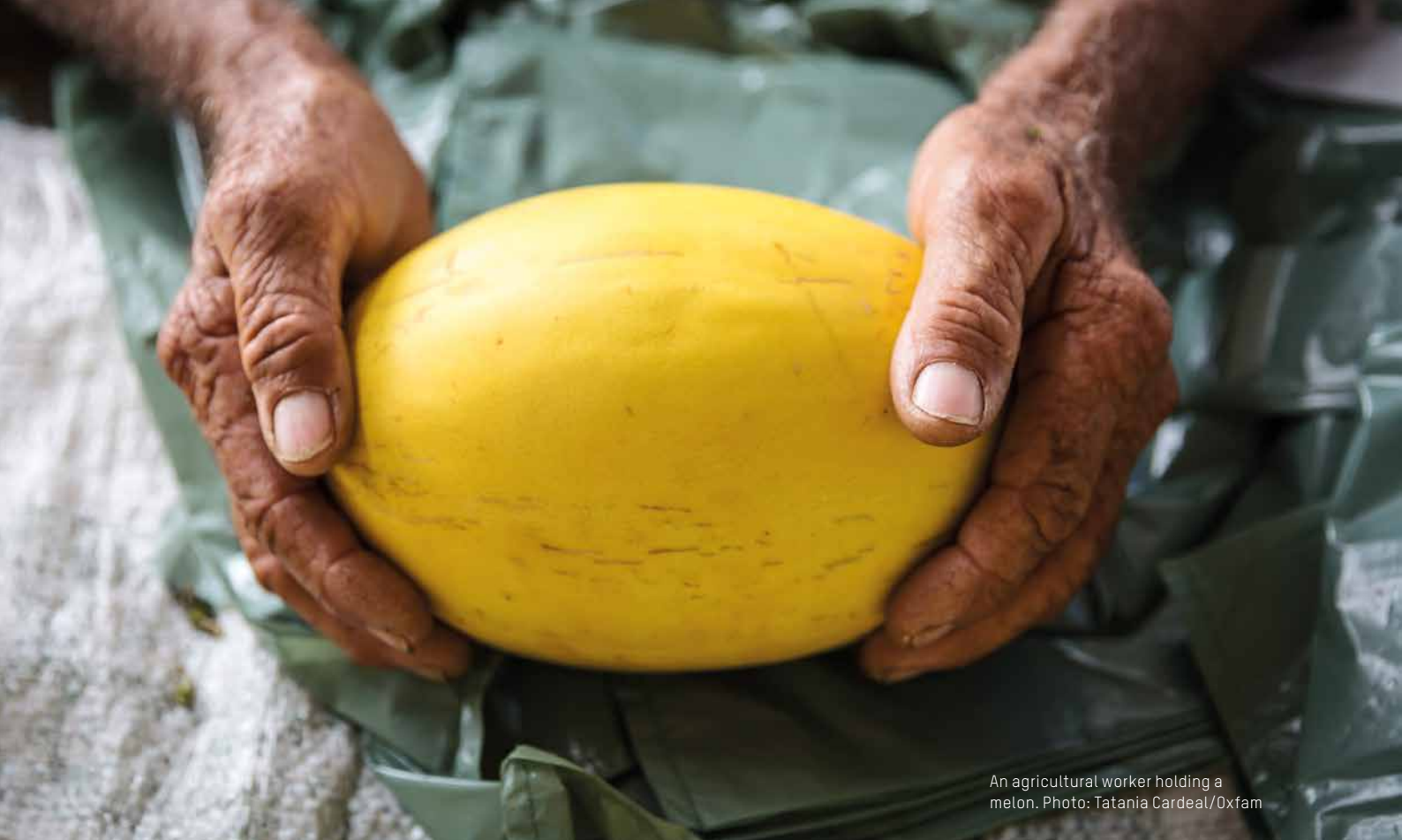
An agricultural worker holding a melon.

For each one of these goals, supermarkets are asked to work through four areas of focus. Steps needed to achieve fair and equal treatment for women are integrated into the recommendations.