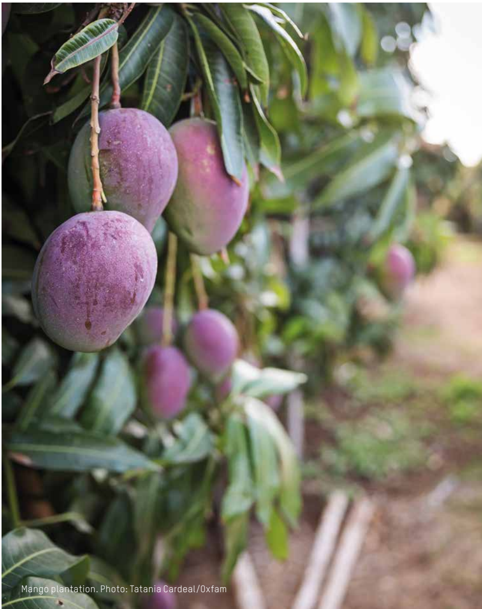
Mango plantation.

However, the performance of half of the companies in Oxfam's scorecard remains woeful. ALDI North (0), Edeka (0), Whole Foods (4), Kroger (4), Lidl (6), Albertsons (8) and Rewe (8) all have workers' rights scores that are less than 10% against Oxfam's benchmarks of good practice, while others such as PLUS have failed to improve over the course of the year.