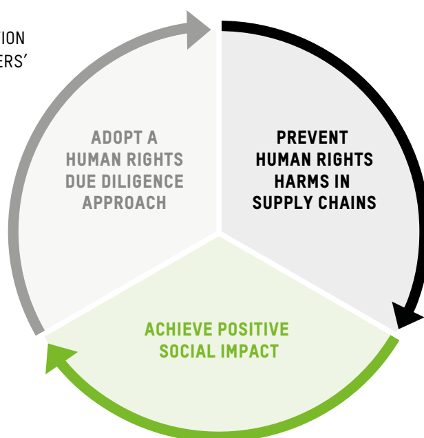
FIGURE 6. SUPERMARKET ACTION TO IMPROVE WORKERS' RIGHTS IN FOOD SUPPLY CHAINS