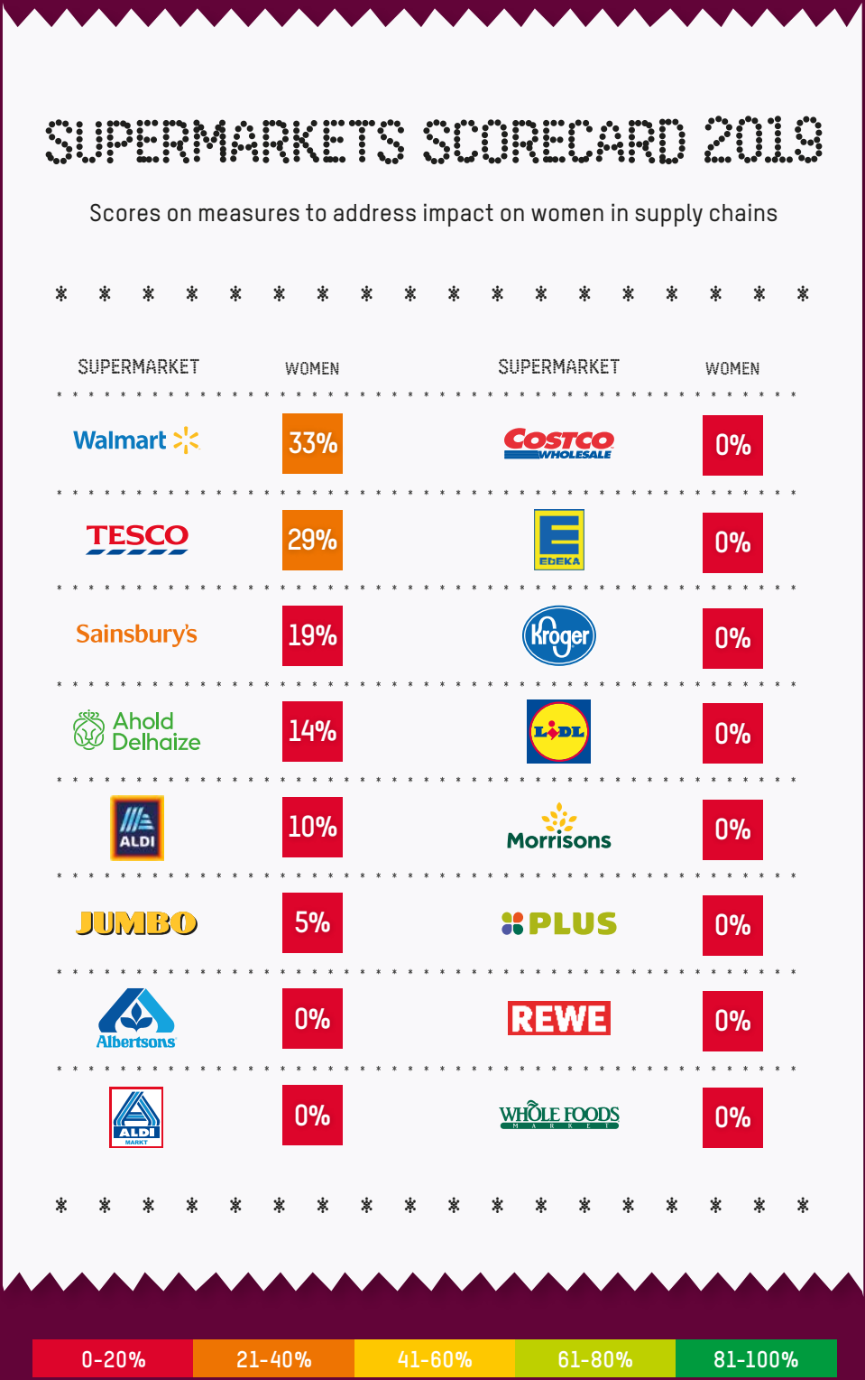
FIGURE 4. GENDER SCORES IN OXFAM'S SUPERMARKETS SCORECARD (2019)

Note: Scores are based on an assessment of measures taken by supermarkets to address specific human and labour rights impacts on women in their food supply chains. Scores are given based on publicly available information measured against a set of indicators of recognized good practice. Percentages given are the points scored as a percentage of the total score available on the women theme of Oxfam's scorecard for 2019. Full data and methodology is available here: https://policy-practice.oxfam.org.uk/publications/behind-the-barcodes-supermarket-scorecard-2019-data-620836