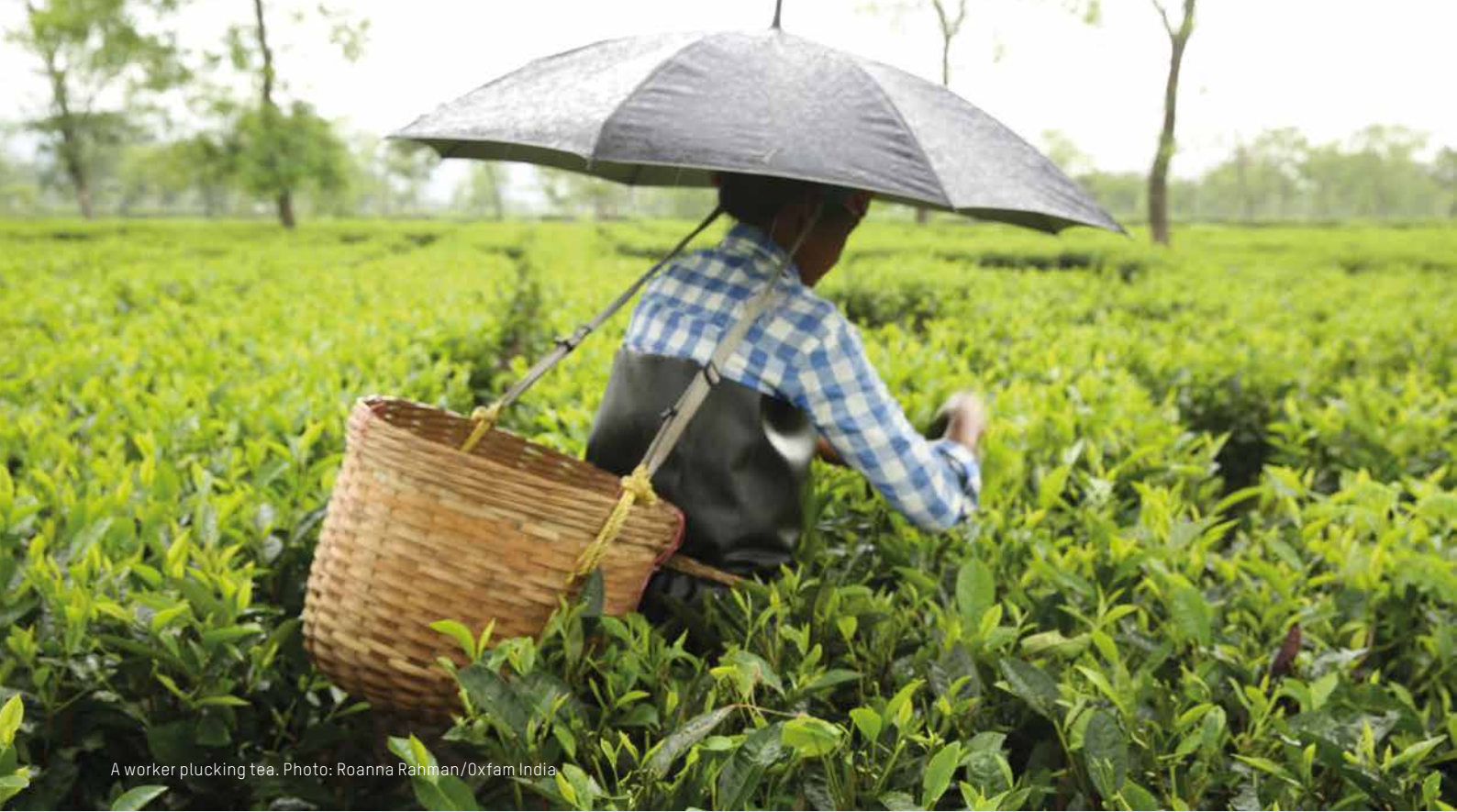
A worker plucking tea.

The root cause of this crisis is a historical legacy of injustice for Assam's workforce, coupled with an inherent inequality of power, meaning that supermarkets and tea brands can exert an ever-greater price squeeze on the estates that supply them with private label and branded Assam tea.