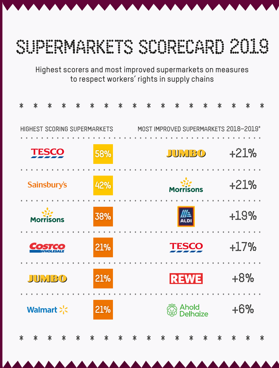
FIGURE 5. HIGHEST SCORERS AND MOST IMPROVED ON OXFAM'S SUPERMARKETS SCORECARD (2019)