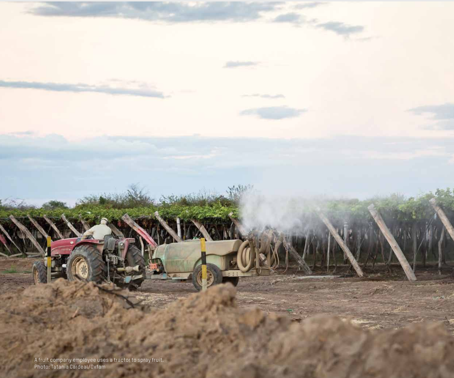
A fruit company employee uses a tractor to spray fruit.