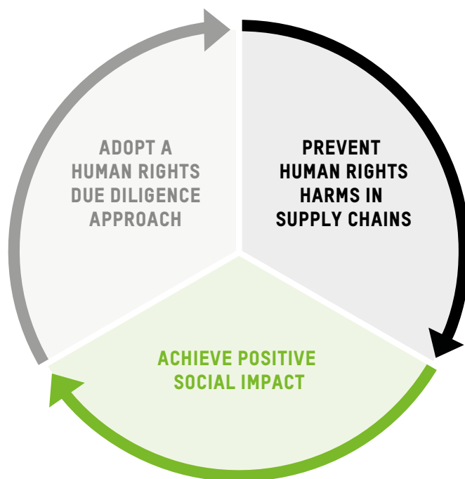
FIGURE 1. SUPERMARKET ACTION TO IMPROVE WORKERS’ RIGHTS IN FOOD SUPPLY CHAINS

Given these developments, companies will only face growing pressure to demonstrate how they are addressing workers’ rights issues. To help them, Oxfam has released a framework with clear and actionable recommendations for supermarkets on workers’ rights.