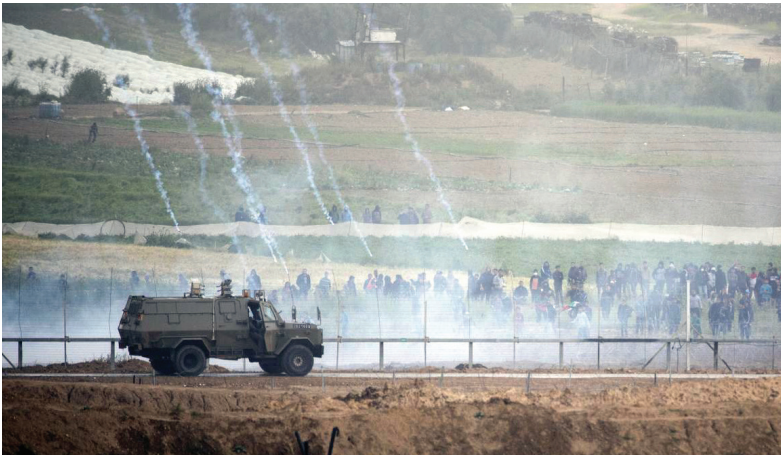
Israeli soldiers shoot tear gas at Palestinian protesters participating in the Great March of Return | Gaza | Photo by Activestills | 30 March 2019

The International Committee of the Red Cross (ICRC) told the Israeli newspaper Haaretz that as a result of the spraying, “crops as far as 2,200 meters from the border fence were damaged”, with some crops 100-900 meters from the fence “completely destroyed.” This included areas under an ICRC project to rehabilitate Gazan farmland damaged by Israeli military attacks. The ICRC further stated that the chemicals used may have negative health impacts on those who consume affected crops or inhale the chemicals. 54