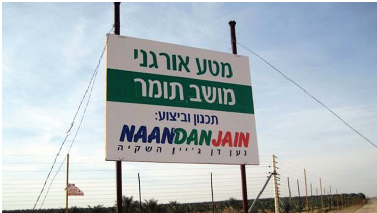
NaanDan Jain Irrigation company sign | Tomer settlement, Jordan Valley, West Bank | | 4 February 2009

The company has distributors in the Syrian Golan, the Jordan Valley and the Naqab (Negev) region.