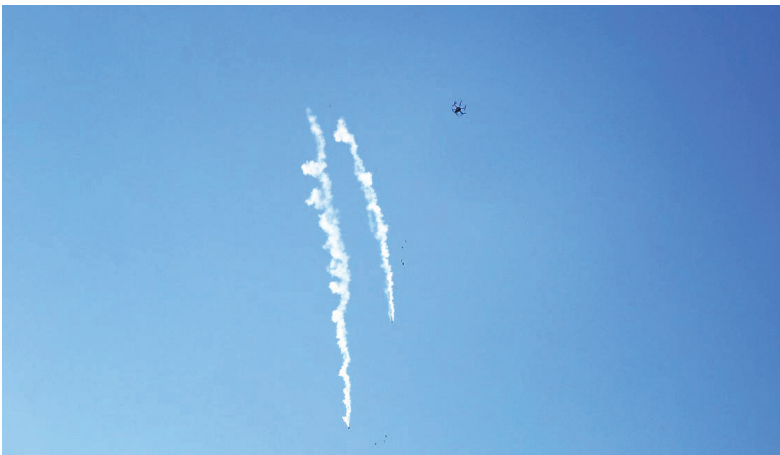
An Israeli drone documented in a Great March of Return demonstration | Gaza | Photo by Activestills| 10 August 2018

commercialization of military knowledge developed in the context of the Israeli occupation. The first involves a partnership between the Israeli irrigation technology provider Netafim and mPrest Systems, the developer of the command and control system in the Israeli missile defense system, Iron Dome. The second involves the adaptation of the Cormorant, an unmanned aircraft developed in collaboration with the Israeli military's medical corps, for aerial spraying. The final two are collaborations between agritech companies and two major Israeli military corporations, Elbit Systems and the state-owned Israel Aerospace Industries.