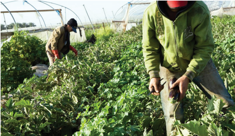
Exploitative labor conditions in settlement agriculture | Ma’ale Afrayim settlement, Jordan Valley, West Bank | 21 March 2009

water, originates in the Golan. 43 The Office of the United Nations High Commissioner for Human Rights noted that Israeli settlements in the Golan are incentivized by a disproportionate allocation of water resources for agricultural production, which contributes to a higher agricultural yield for settlers choosing to move to the area. 44 By contrast, Syrian farmers are discriminated against. It is estimated that they pay up to four times more than their Israeli counterparts for water. 45 Historically, Israeli authorities have cited Syrian agriculture’s “primitive” use of water as a justification for prohibiting the expansion of Syrian irrigation schemes to new orchards. 46