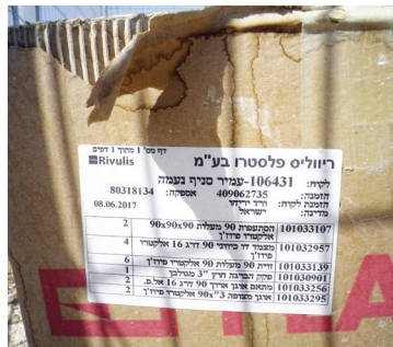
Rivulis Irrigation | Jordan Valley, West Bank | | 18 October 2017