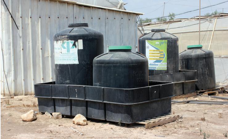
Deshen Hatzafon and ICL Group fertilizer tanks | Mehola settlement, Jordan Valley, West Bank | | 18 June 2019