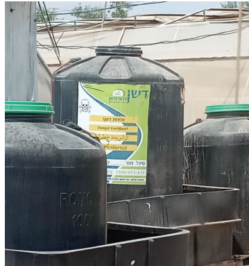
Deshen Hatzafon fertilizer tanks | Mehola settlement, Jordan Valley, West Bank | | 18 June 2019