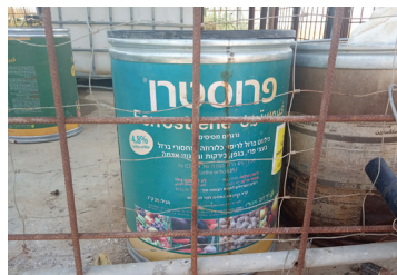
Gadot Agro (Merhav Agro) products | Jordan Valley, West Bank | Photo by Who Profits | 18 June 2019