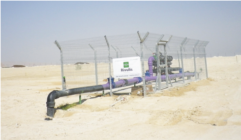
Israeli irrigation pipes serving illegal settlements | Jordan Valley, West Bank | | 18 October 2017

a researcher at the Volcani Center's Institute of Plant Sciences was supported by two R&D centers located in illegal settlements; Regional Shomron and Jordan Valley R&D, and Central Mountain (Mt. Hebron) R&D. Moreover, the research itself was carried out in plots in the West Bank and the Syrian Golan. 18 A 2019 conference at the university of Ariel (an illegal settlement) showcased recent research on medical marijuana and on precision irrigation models based on quantifying water consumption in wine grapes. The research presented was the product of collaboration between the Hebrew University, Ariel's R&D Center and Regional R&D East: Judea and Samaria and the Jordan Valley. 19