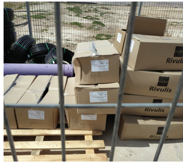
Rivulis Irrigation boxes | Beit Haarava settlement, Jordan Valley, West Bank | | 28 March 2019