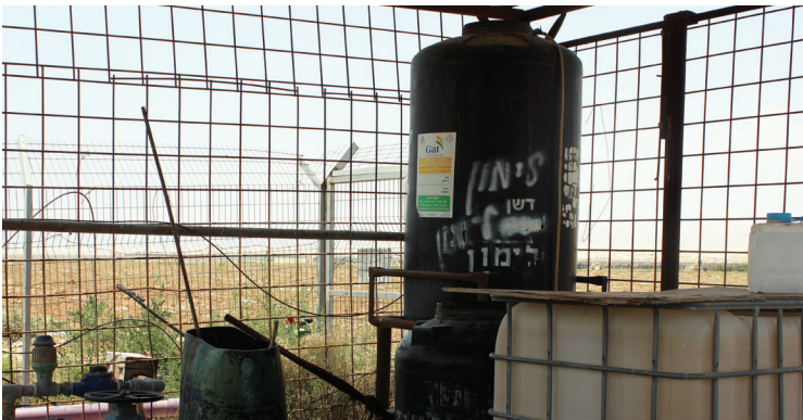
Gat Fertilizers fertilizer tank | Beit Ha'arava settlement, Jordan Valley, West Bank | | 18 June 2019

The company employs agronomists to serve its clients in the Jordan Valley and the Syrian Golan.