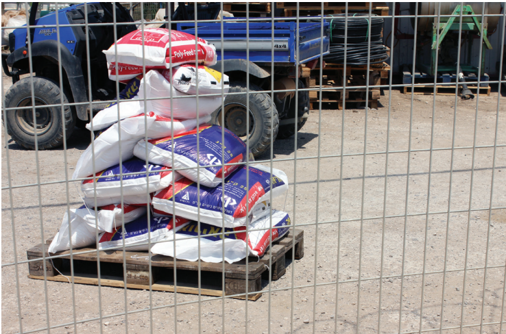
Israel Chemicals and Haifa Chemicals fertilizer bags| Mehola settlement, Jordan Valley, West Bank | Photo by Who Profits | 18 June 2019

Global presence: Australia, Belgium, Brazil, China, France, Greece, Mexico, South Africa, Spain, Thailand, Turkey, USA, Global