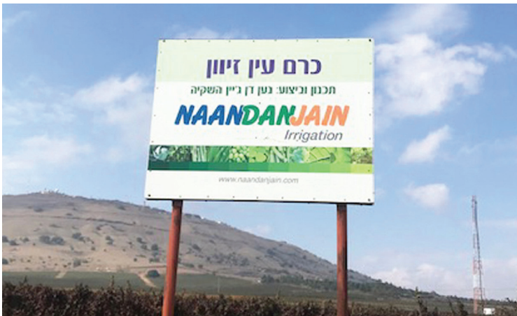
NaanDan Jain Irrigation company sign | Ein Zivan settlement, Syrian Golan | | 10 November 2018

Global presence: Argentina, Australia, Brazil, Chile, China, Colombia, Costa Rica, France, India, Italy, Kazakhstan, Mexico, Peru, Romania, Spain, Turkey, USA