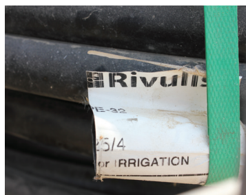
Rivulis Irrigation products | Jordan Valley, West Bank | | 18 June 2019