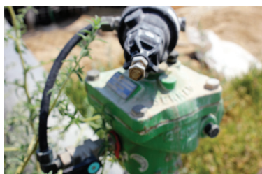
Irrigation technologies serve illegal Israeli settlements | Jordan Valley, West Bank | 18 June 2019

Agritech is a lucrative market, with Israeli agritech exports generating a total of 5,993 million USD in revenue in 2018. This figure marks a 4% increase from the previous year. Fertilizers, other chemicals and irrigation products accounted for 44%, 24% and 13% of all Israeli agritech exports respectively. The European Union imported 30% of Israeli agritech exports followed by Asia (22%), South and Central America (20%) and the United States (18%). 7