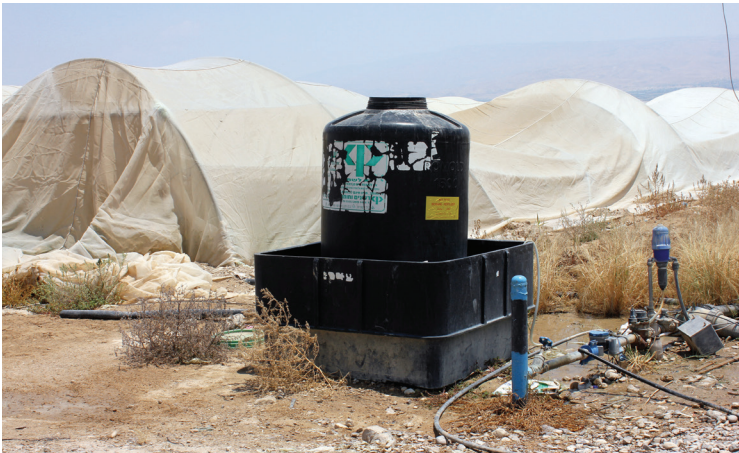
Israel Chemicals fertilizer tank | Na'ama settlement, Jordan Valley, West Bank | 18 June 2019

Global presence: Argentina, Austria, Australia, Brazil, China, Germany, Hong Kong, Mexico, Netherlands, Spain, Turkey, USA, UK, Global