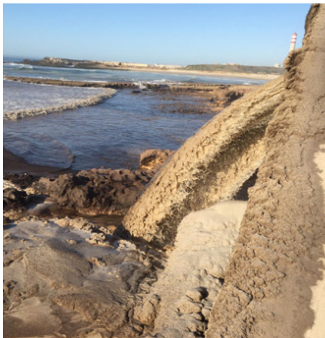
Waste water from the Safi OCP factory is discharged directly into the sea.

sulphide (H 2 S) and hydrogen fluoride (HF) measurements on and around its sites, despite requests from the research team.