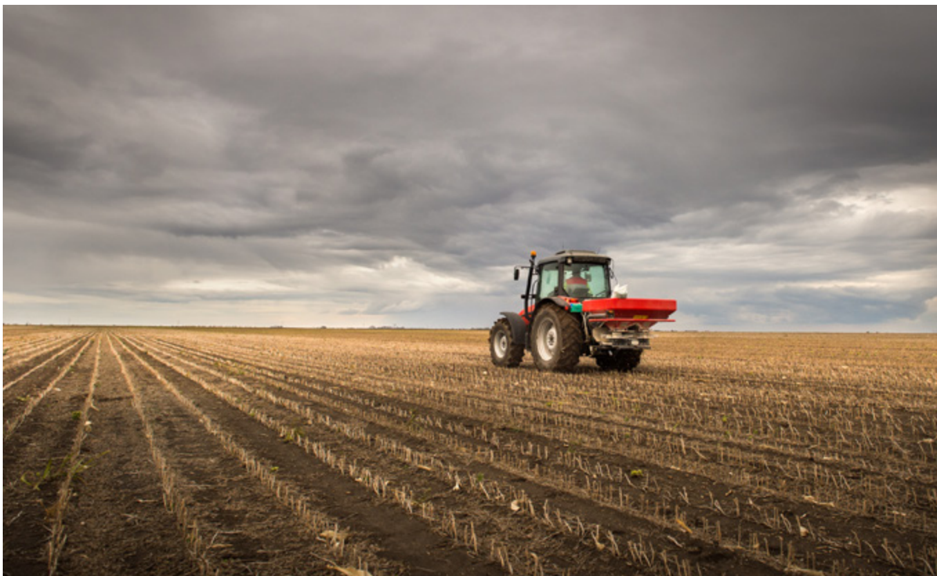
The type of agriculture pushed by OCP is not sustainable.

trading and the fact that OCP is one of the world's biggest producers of phosphate fertilisers, it is probable that these companies are trading OCP products. The authors of the report sent these companies a questionnaire to ask them if they purchase phosphate products from OCP and if they use human rights and environmental criteria to assess producers' practices. Of the 22 companies contacted, four responded to the authors' requests (Yara, Keytrade, Ameropa and Mambo). These companies have commercial links with OCP and stated having failed to carry out a detailed human rights analysis of OCP.