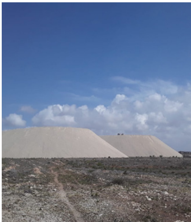
Piles of phosphate near the Safi OCP factory.

In the villages surrounding the OCP site in Jorf Lasfar, the people interviewed in March 2019 spoke of “strong smells of acid, fluorine and ammonia, especially at nightfall” 5 . The research team measured between 25 and 125 µg/m 3 of fine particles: the lower value corresponds to the value recommended by the WHO, while the higher value is five times that of the WHO. Children told the researchers how they were forced to cover their noses with a rag on the way to school because of the strong chemical smell and toxic emanations coming from the OCP factory.