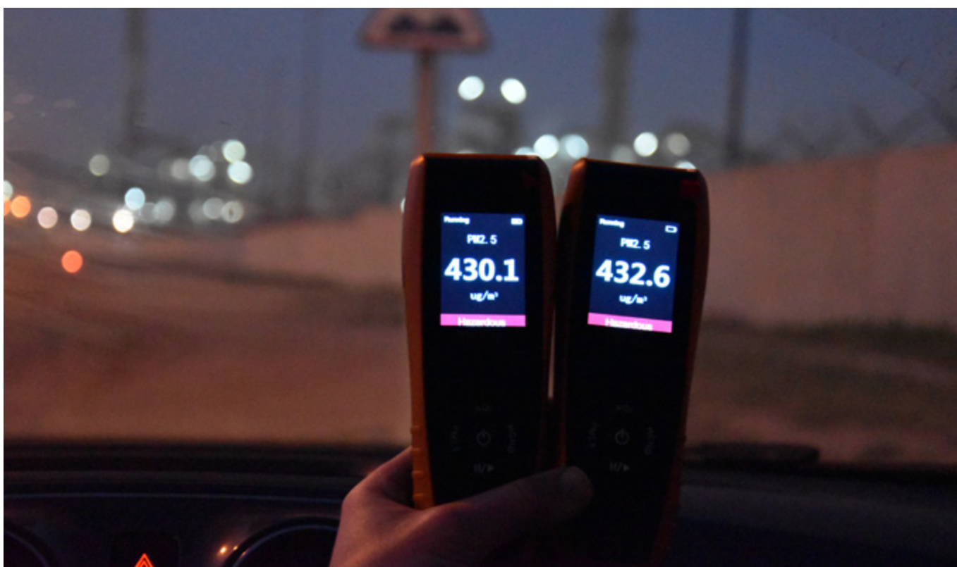
The level of particulate matter (PM2.5) in the vicinity of the OCP factories is massively above WHO limits.

Our measurements of the air quality in February and March 2019 showed a high level of fine particle pollution around the Jorf Lasfar OCP site. The research team measured between 25 and 125 \mu\text{g}/\text{m}^3 of fine particles: the lowest value corresponds to the WHO's maximum daily guideline value, while the highest value exceeds five times that value.