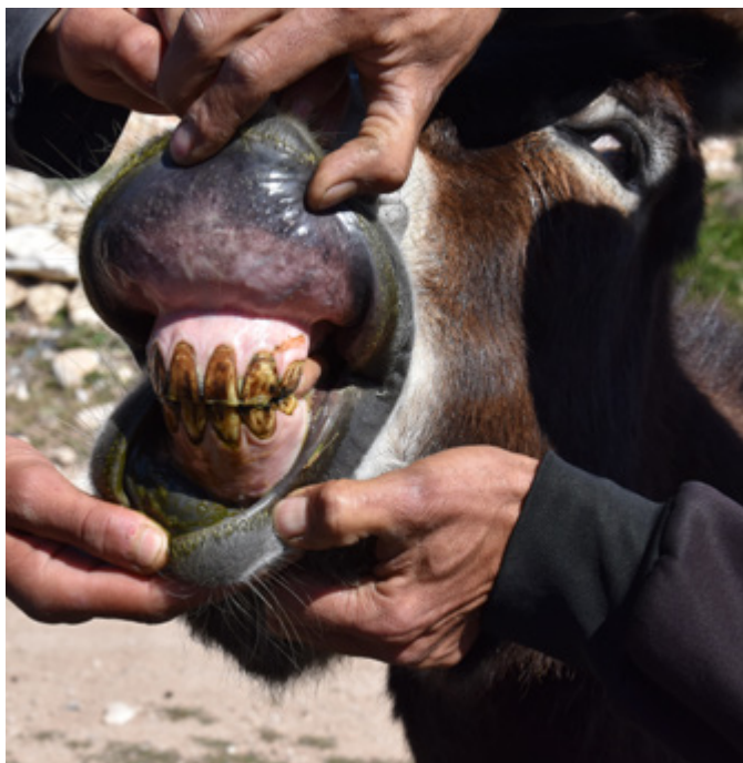
Many donkeys near the OCP factories suffer from dental fluorosis.