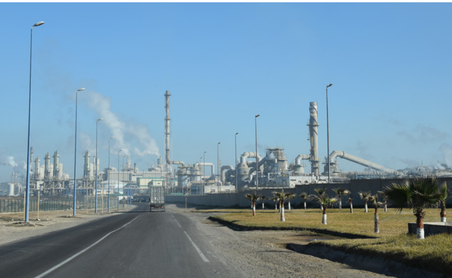
Safi's OCP factory emits large quantities of pollutants.