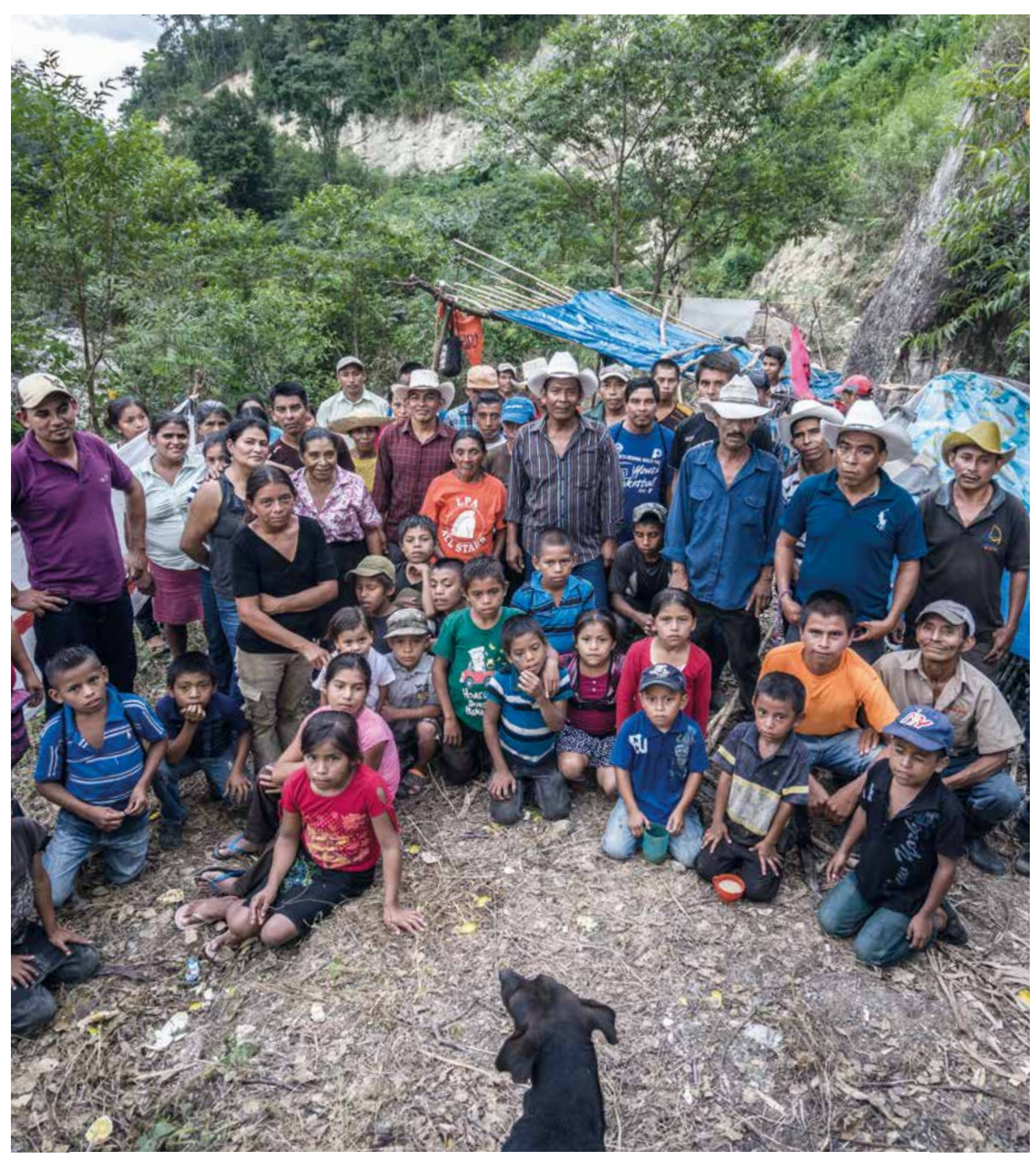
Three\ members\ of\ COPINH\ were\ killed\ last\ year\ in\ the\ struggle\ for\ indigenous\ rights\ in\ Honduras.\ @\ Giles\ Clarke/Global\ Witness