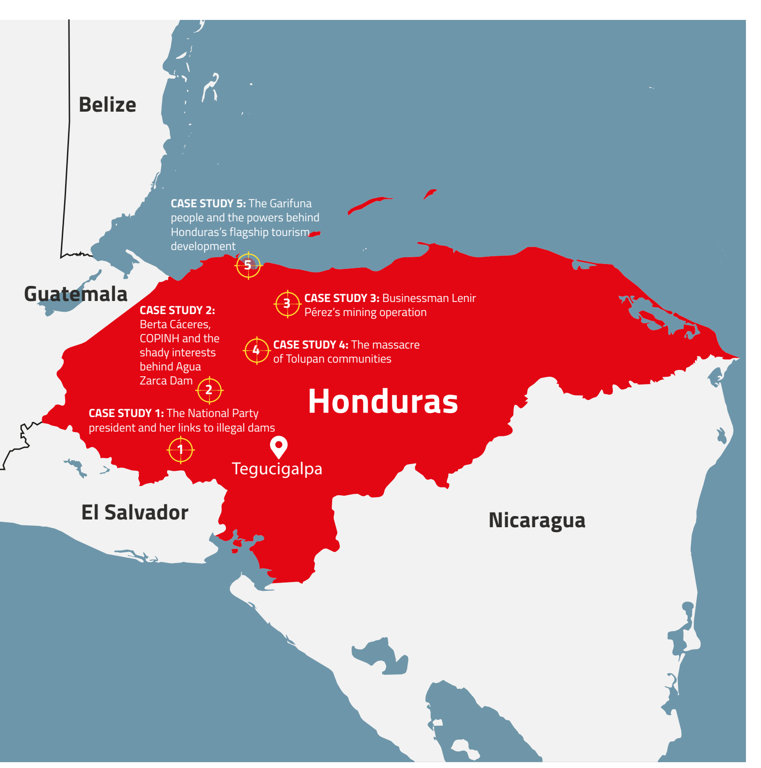
Map of project sites, covered in this report, causing attacks against Honduran activists. Original map from © FreeVectorMaps.com

The result has been that commercial interests have taken precedence over the rights and needs of local people, with brutal consequences. The government, in league with business interests, criminalises community leaders for speaking out against projects imposed on their land. And the international community is complicit, with the Honduran government receiving huge influxes of US aid and some of the most controversial projects being backed by international financial institutions.