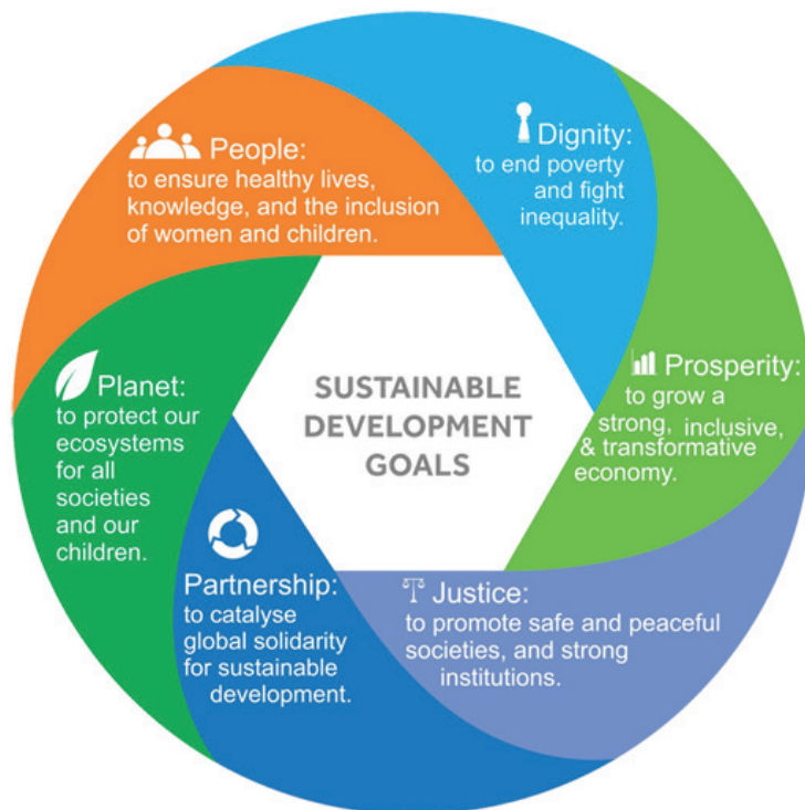
Figure 1: The six core themes of the international agenda for sustainable development