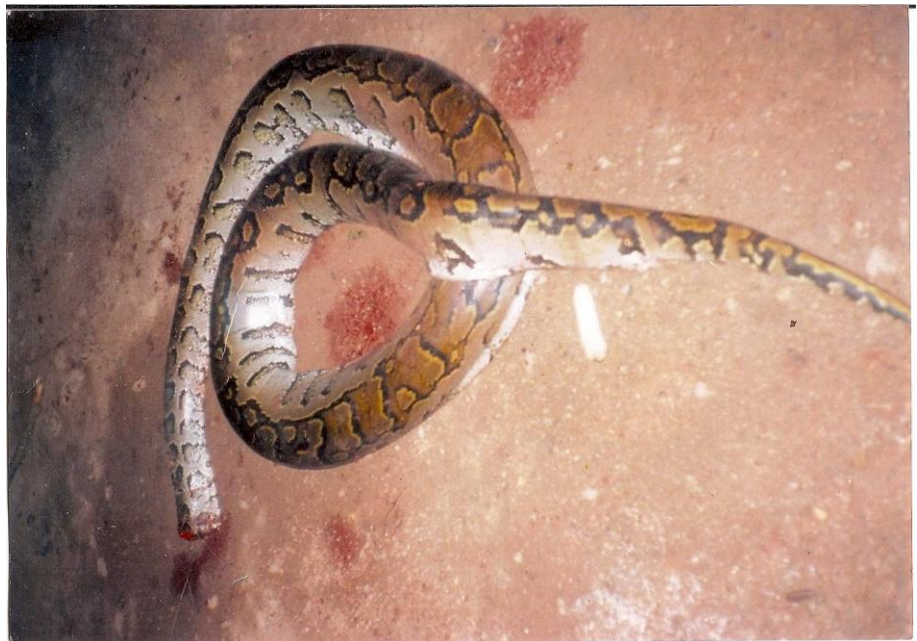
(Picture above shows one of the pythons that visit the homes of some communities affected by the Subri Dam. This has become a regular occurrence in the communities affected by the construction of the Subri Dam)

The dams constructed by Newmont Ahafo mine have created safety, economic and social problems for many communities. For example communities living around the dam constructed by Newmont Ahafo mine on river Subri complained to the company management that the dam had resulted in social exclusion by increasing the distance to other communities. The people stated that they do not feel safe because people had drowned in the dam and the blockage of the flow of river Subri by the dam has forced reptiles such as snakes including big pythons to invade their communities thus increasing the incidence of snake bites in the communities among other problems. The dams have become breeding grounds for mosquitoes and other flies. The communities have complained about increased malaria incidence and made allegations on the incidence of cases of buruli ulcer.